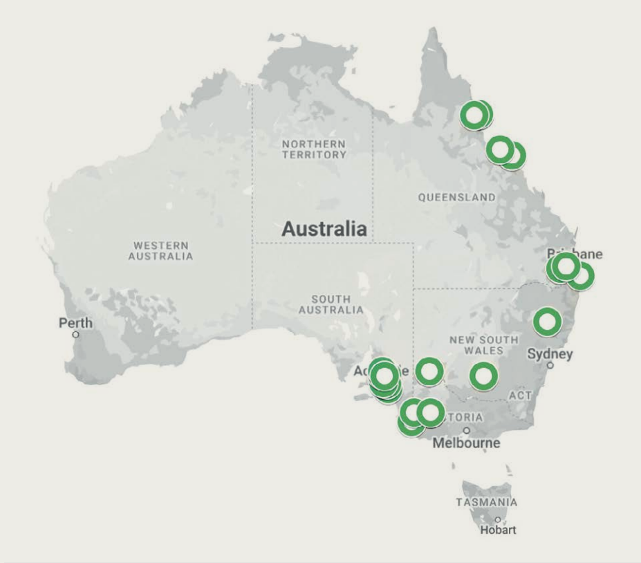
FIGURE 2. SENTINEL DEPLOYMENT LOCATIONS

While the sentinels sampled airborne pests and pathogens, researchers trialled new and emerging diagnostic tools that aim to speed up the delivery of accurate information on what exactly is captured. iMapPESTS included the development of diagnostic tests using next-generation sequencing by AgVic, Sugar Research Australia and University of Queensland. In addition to speeding up accurate reporting of target pests, the iMapPESTS diagnostics collaboration is exploring high throughput sequencing (HTS) to investigate ways of reporting on a wider range of insects captured, including targets of biosecurity concern. This is because the HTS approach takes a sample of insects or fungi captured by the trap and sucks out all the genetic code, resulting in a 'DNA soup' that can be scanned using a reference tool, or database, of known DNA codes for hundreds of thousands of different insects or fungal species. If a particular species was trapped, its DNA code will be present in the soup and flagged by the reference database, indicating its presence in the trap. These techniques have the potential to detect many targets in one test and identify biosecurity threats early, allowing for a more effective response to an incursion.