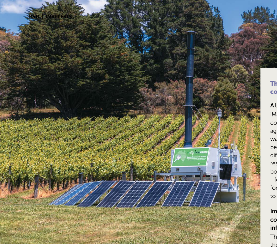
Above. Sentinel 7 at Tapanappa Wines.

These activities extended the research and development to practical applications. The team coordinated with key industry contacts to collaborate on the publication of 63 project progress articles, ranging from extensive results-based articles in industry publications to short online news communications and newsletters. In addition, the team delivered or facilitated the delivery of 44 information sessions at R&D forums, field days, conferences, and workshops. All communication outputs were heavily dependent on project partners supplying correct and up-to-date information on the surveillance initiative progress to AUSVEG.