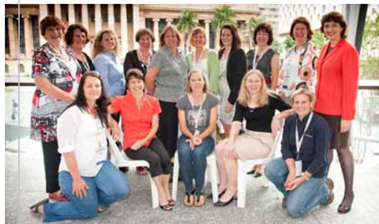
Some of the guests at the 2011 Women in Horticulture breakfast