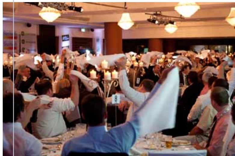
The 2011 AUSVEG National Awards for Excellence Gala dinner