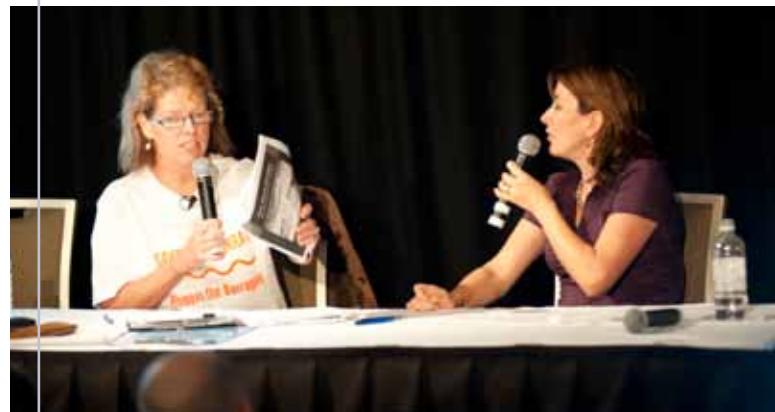
2011 Great debate