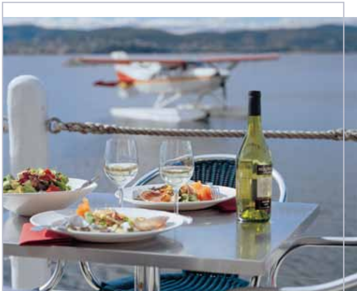
Wrest Point Hotel Casino

Transport: Buses will depart Wrest Point at 11.00am for Salamanca, and then depart Salamanca at 12.30pm and arrive back at Wrest Point at 12.45pm.