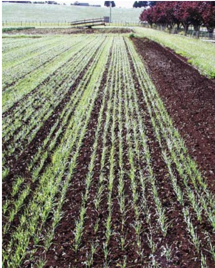
Fig 1(a): Rye corn cover crop in broccoli. The blue arrows indicate the gaps left for the broccoli transplants. The cover crop was left to grow to 80 cm - 1 m in height before being sprayed off.

Cover cropping for weed suppression in broccoli.