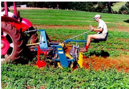
Fig 2(c): Brushweeding carrots.