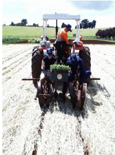
Fig 1(b): Transplanting the broccoli into the cover crop. Prior to broccoli transplanting the cover crop was rolled flat once it had desiccated.