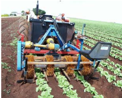
Fig 2(a): The large brushes removing inter-row weeds in a lettuce crop.