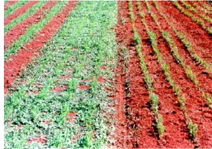
Fig 2(b): Right hand side has been brushweeded. The left hand side was left untouched.