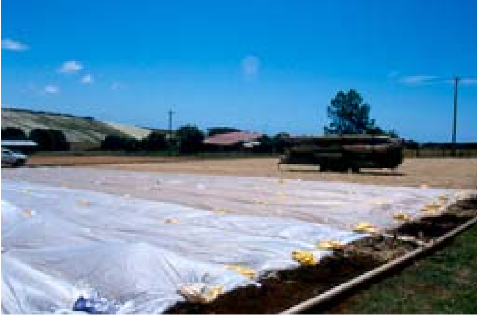
Fig 3(a): Insect exclusion netting covering broccoli plants.