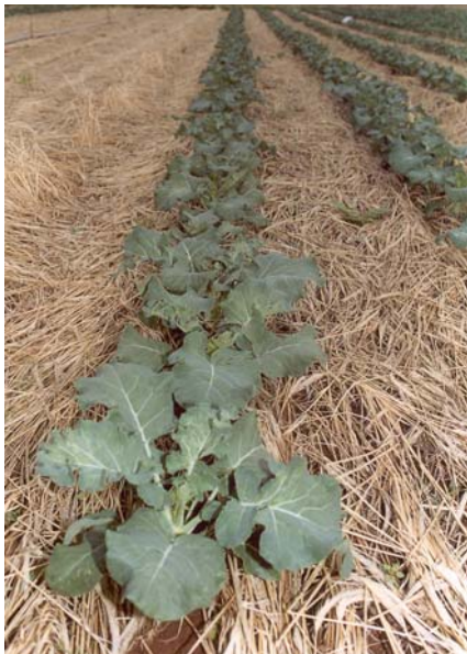
Fig 1(c): Broccoli in the rye corn cover crop.