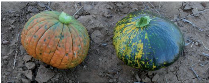
Infected cucurbit produce.

Virus diseases in cucurbit crops infect the plant before flowering or at flowering; it is at this time when yield reductions occur. Project VG06022 identified some of the pathways in which these viruses can infect crops and impact marketable yields and investigated the immense damage on cucurbit crops across the northern areas of Australia in particular. Through multiple field trials and research, a set of more informed management strategies for virus diseases in vegetable cucurbit crops has been developed.