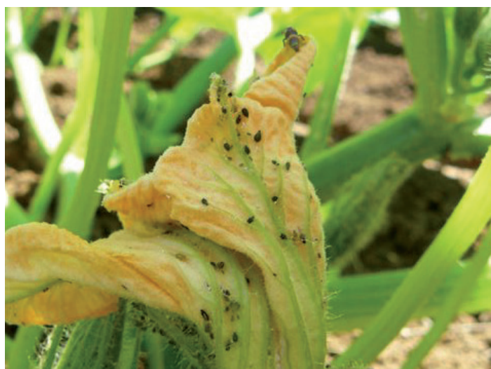
Aphids on pumpkin flower.

Project VG06022 sought to increase understanding within the horticulture industry of the epidemiology and control of virus diseases in field grown vegetable cucurbit crops. There were three key components of this research project: firstly, identifying where viruses were instigated between growing seasons; secondly, determining the impact on yield; and thirdly, developing management strategies which could assist growers to reduce the level of crop infection. Field experiments were carried out in: Kununurra, Carnarvon and Medina, Western Australia, to investigate the effectiveness of cultural control measures in limiting ZYMV spread in pumpkin and single-gene resistance in commercial cultivars of pumpkin, zucchini and cucumber.