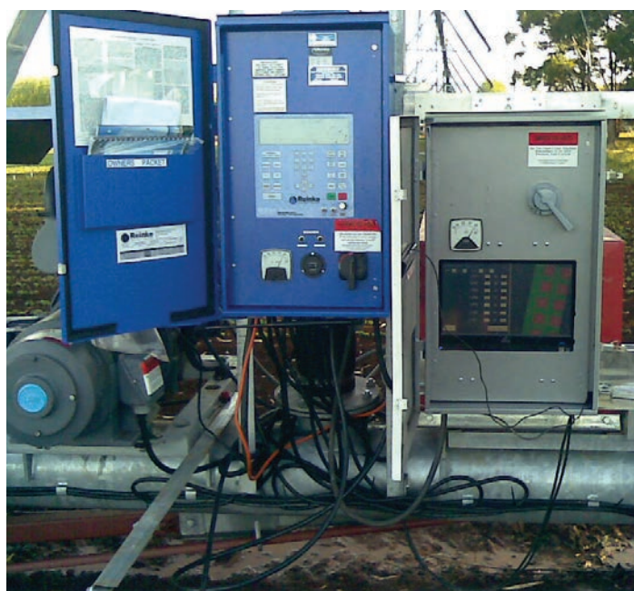
Irrigator control systems for variable rate irrigation (VRI) system on linear move irrigator.

“The retro-fitted component of the technology developed in this project demonstrates an innovative approach to address issues of sustainable natural resource management, adapting to climate change challenges and responding to increases in energy costs,” she said. Dr Lambert also stated that with the proven savings in water expenditure and energy consumption displayed in the project work, it is plausible to estimate that the cost of the modified traveller irrigation system could be recouped in 2-3 years.