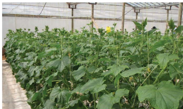
Cucumber crop at demonstration site 5 weeks after transplanting.

Water use efficiency was significantly higher when compared with soil-based crops and a return on investment was estimated within two to six years, depending on the system installed and the crops grown.