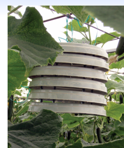
Datalogger in cucumber crop