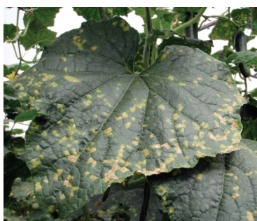
Downy mildew on cucumber