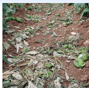
Prunings can harbour disease and re-infect crops