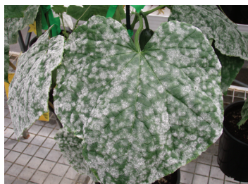
Powdery mildew on cucumber (above) and capsicum (right)