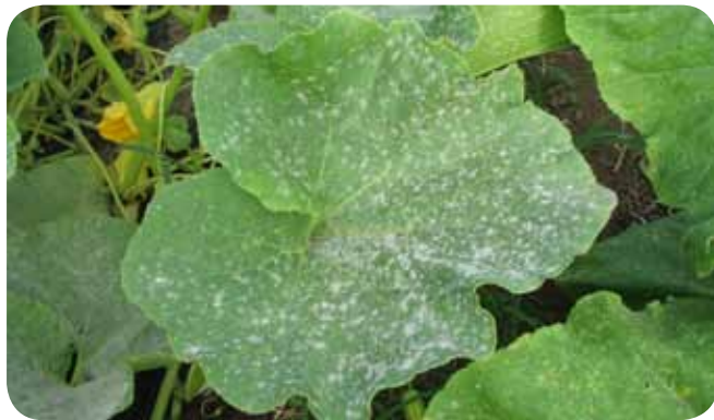
Powdery mildew on pumpkin

Sulphur is the most widely used fungicide for powdery mildew control and despite resistance development being unlikely, sulphur is not suitable for use on all crops, especially during hot weather. Copper may be effective on some downy mildew infections, but on cucurbits the active constituents dimethomorph and metalaxyl are very effective if applied at the onset of the disease.