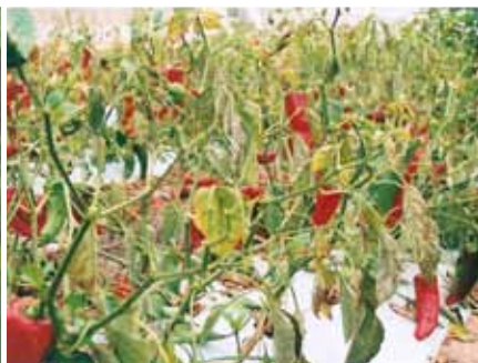
Severe powdery mildew on capsicums