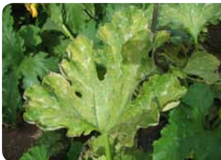
Downy mildew infected zucchini leaf