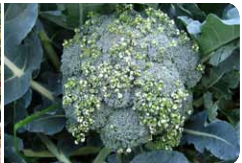
White blister on broccoli