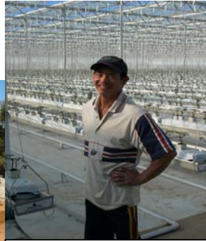
High Technology House (Thien Vu 2006)