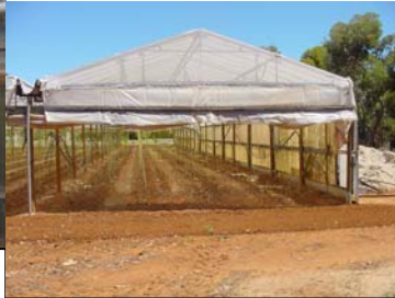
Low Tech. House (Thien Vu 2002)