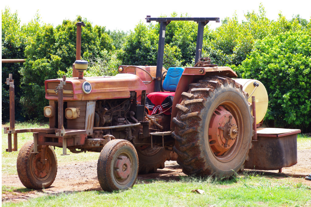
Figure 4.3 Shielded inter-row herbicide unit, Bundaberg Qld

Shielded application of herbicides normally involves using a non-selective herbicide (see Table A1) to manage weeds in non-crop spaces such as headlands, irrigation lines and channels, and around other infrastructure (Figure 4.3 and Figure 4.4). Shielded spraying may also be used between the crop beds or rows ( inter-row spraying ), to manage weeds that may either impact on the crop directly, or host pests and disease. This form of herbicide application carries some risk of crop damage due to drift even when using a shielded spray unit. This risk can be minimised by using wider crop row spacing and larger droplet sizes, however some farmers may choose other weed management options if they feel the risk is too great (Sindel et al. 2011). Farmers applying this method generally use non-selective herbicides for shielded inter-row spraying such as glyphosate or paraquat/diquat, or glufosinate-ammonium. Shielded inter-row herbicide application is an alternative to inter-row tillage (discussed further in Section 4.2.3).