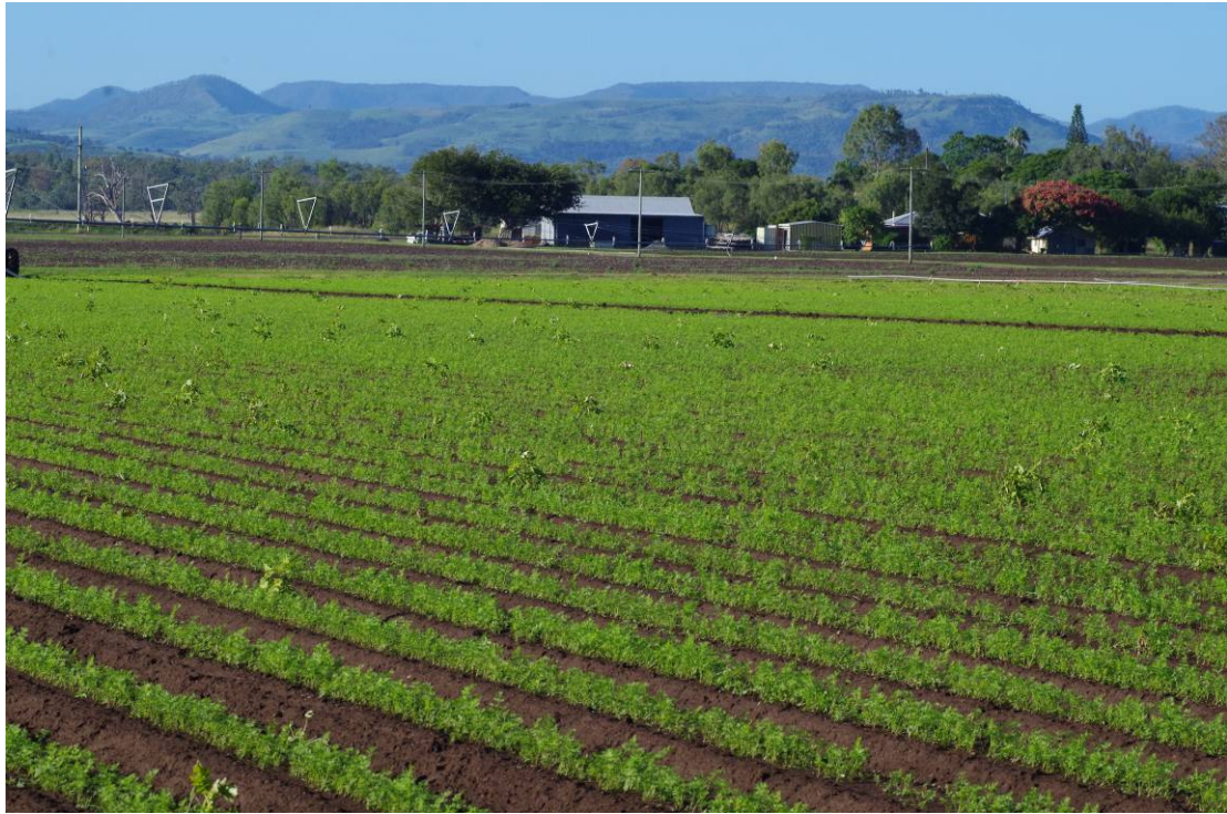
Figure 2.2 Carrot crop near Gatton, Qld.