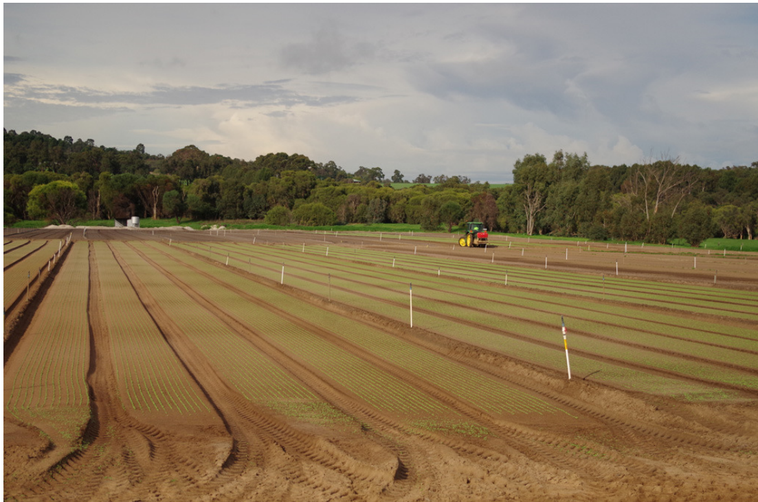
Figure 2.5 New leafy vegetable crop near Gingin, WA.