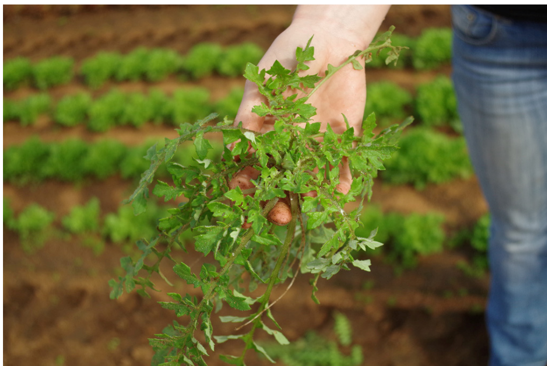
Figure 3.2 Capeweed ( Artotheca calendula ) was found to be a problem in lettuce crops in WA.

Generally, the impact of weeds in vegetable production as revealed through industry consultation confirmed the findings of the literature review. That is, weeds have an economic impact on the farmer, reduce yield, impact on the quality of produce, and can make management of the crop more difficult (Appendix 1, Section 3). Many farmers noted that weeds with functional similarity to their crops had the greatest impact. These were also the most difficult to control, often due to lack of selective herbicide options. In general, broadleaf weeds will be difficult to control in a broadleaf vegetable crop. Reported examples include amaranthus ( Amaranthus spp.) in pumpkin crops in NSW, capeweed ( Artotheca calendula , Figure 3.2) in lettuce crops in WA and SA, and wild radish ( Raphanus raphanistrum ) and wild turnip ( Rapistrum rugosum ) in brassica crops in NSW, WA and SA.