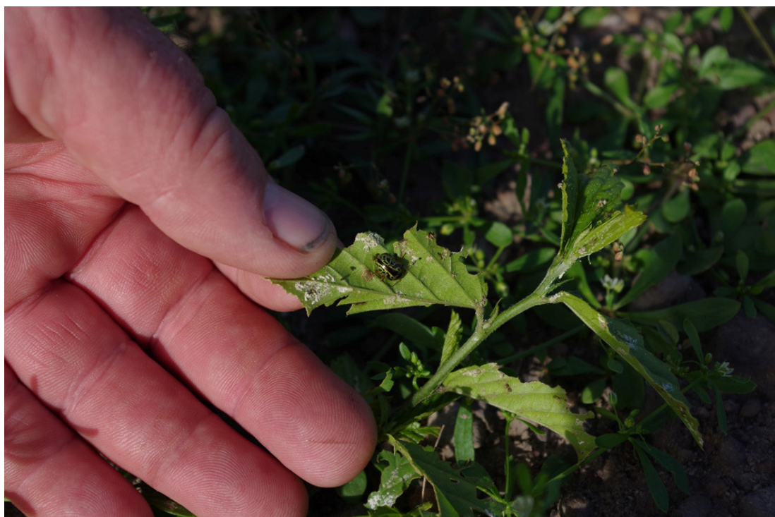
Figure 5.1 Calligrapha pantera , released in NT as a biological control of the weed Sida acuta .