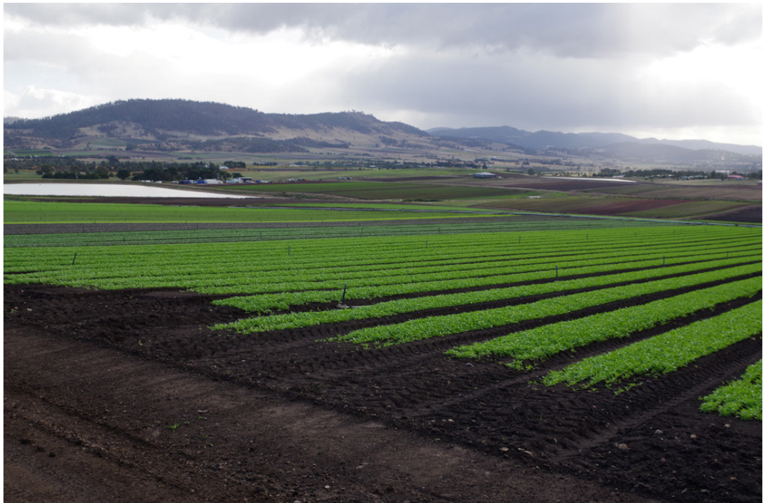
Figure 2.3 Cut leaf vegetable farm near Richmond, Tas.