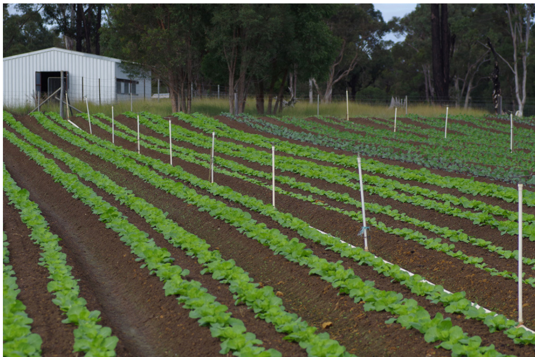
Figure 2.8 Mixed vegetable farm south of Richmond, NSW.