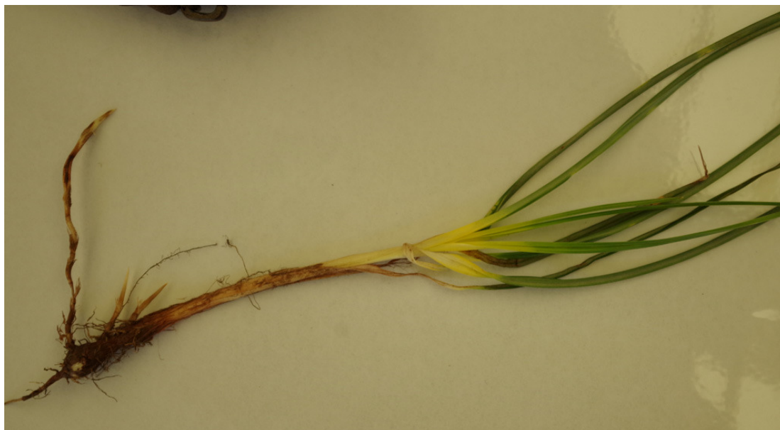
Figure 3.4 Nutgrass ( Cyperus rotundus ) plant parts, plant removed from a lettuce crop near Gingin, WA.

Nutgrass is a significant problem in crops where plastic mulch is used. It is capable of piercing the plastic film (Figure 3.5) and attaching clods of soil to the underside, making it more difficult and expensive to dispose of plastic after harvest, as it is heavier to remove from the field, and disposal charges are sometimes by weight (such as in the Richmond district in NSW). Piercing of the plastic was noted in NSW and NT, while NSW farmers also noted that nutgrass has been seen to pierce plastic drip irrigation tape. Nutgrass can also reduce the quality of root vegetables by piercing the crop – a phenomenon noted by project participants in Qld (in carrots), in NSW and NT (in potatoes), and in WA (in onions).