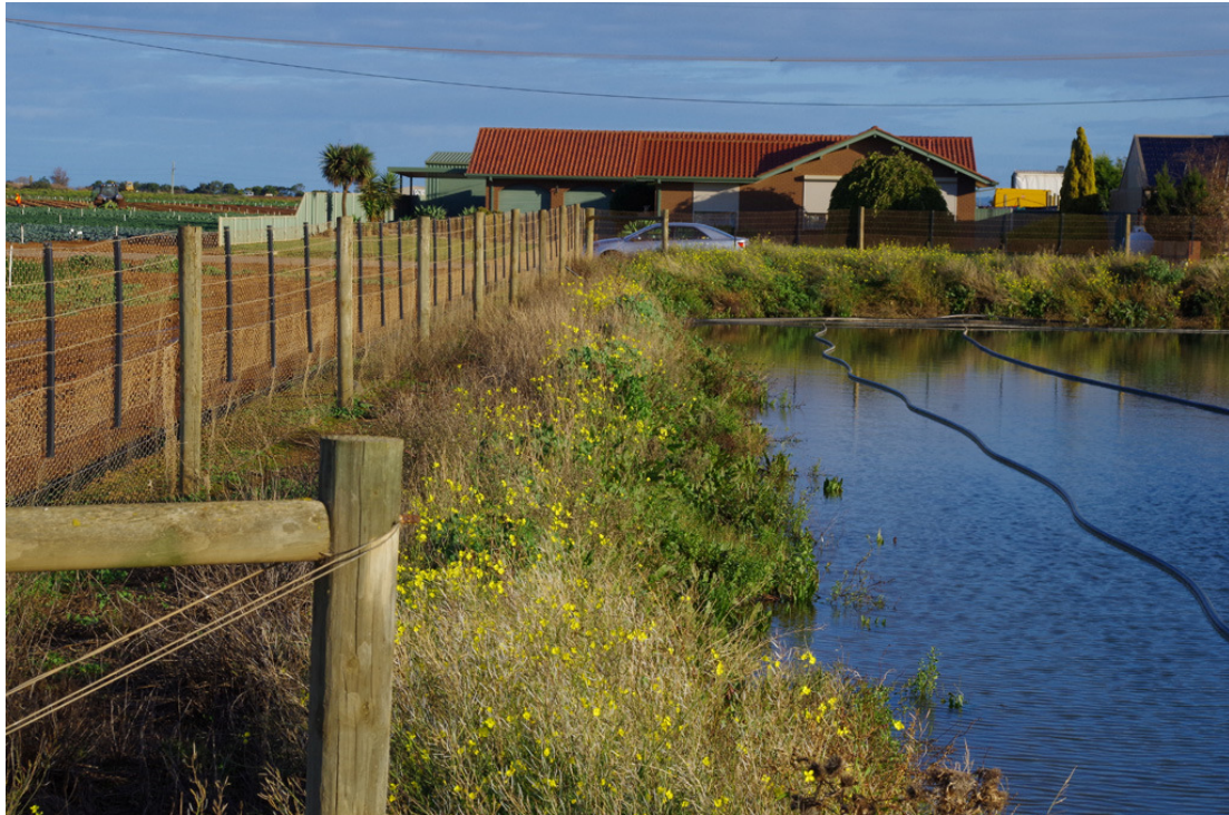
Figure 5.6 Weedy non-cropping areas, such as this storage dam bank near Werribee, Vic, may be important refuges for crop pests, viruses and diseases.