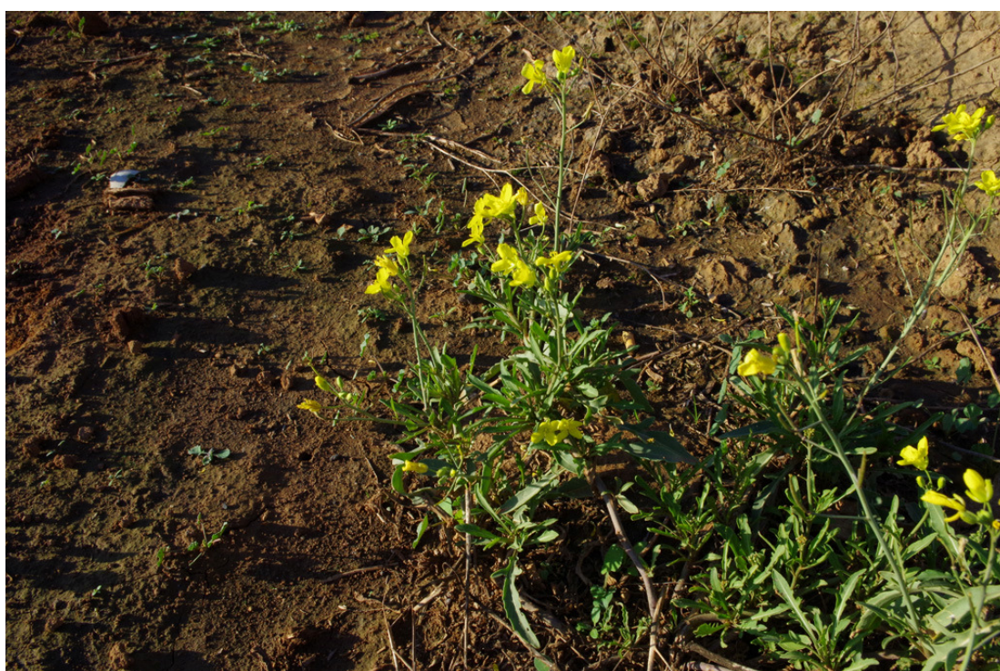
Figure 5.5 Wild radish is an important weed of brassica crops, and is hard to manage due to its similarities to these crop species.

herbicides are not available for brassica crops (Section 5.1.1), other strategies are required. We observed many examples of excellent weed control within brassica crops in these states, in which a mixture of tillage, pre-emergent herbicides and hand weeding were used diligently and with appropriate timing to ensure maximum effectiveness. Farmers in WA suggested that the available pre-emergent herbicides allowed them to keep on top of weeds within their brassica crops. However, farmers still generally agreed that effective weed management in brassica crops was an ongoing problem. Nonetheless, the strategies adopted by successful farmers provide a good example for those struggling to manage weeds in general, and broadleaf weeds in particular, in brassicas. Several useful extension publications are available on pest and weed management within brassica crops (Appendix 1, Table 9.2).