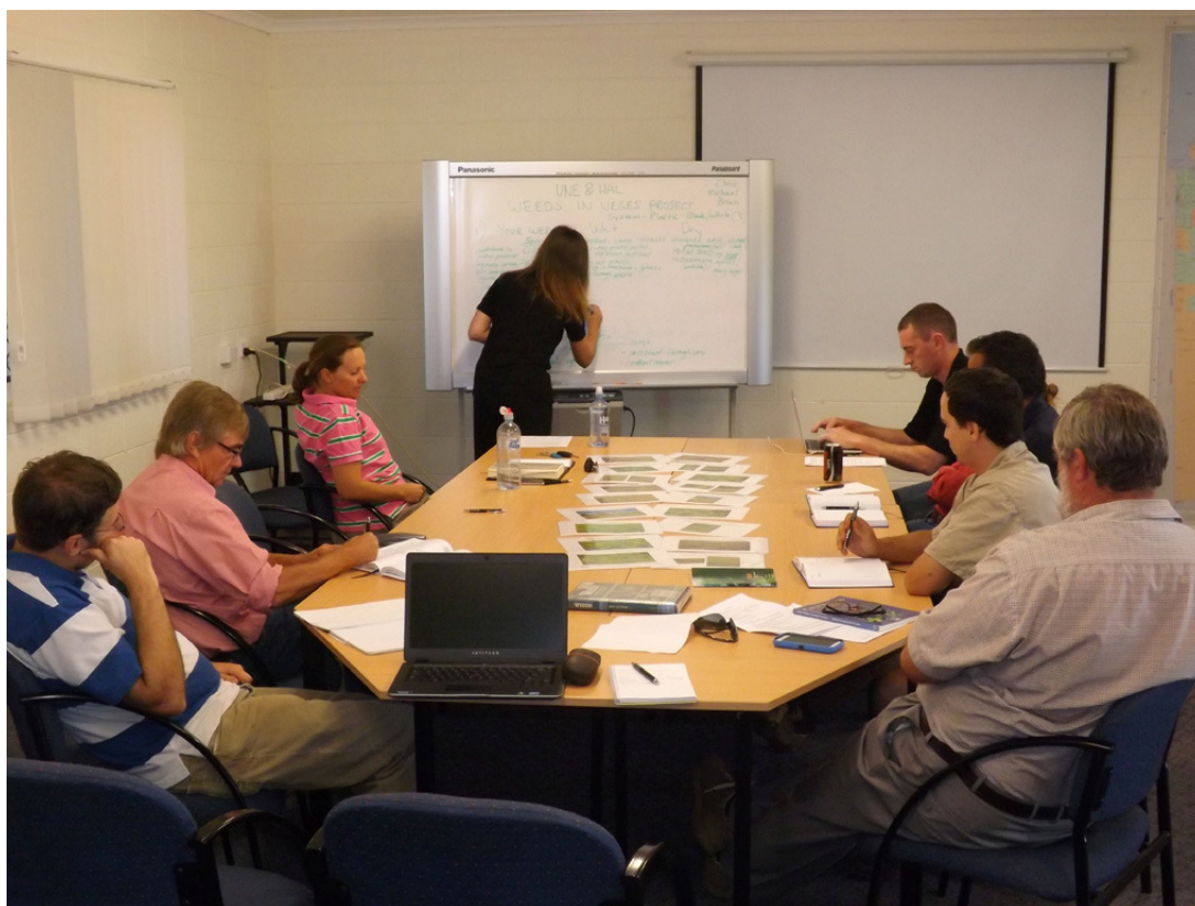
Figure 2.1 Focus group meeting in Katherine, NT.