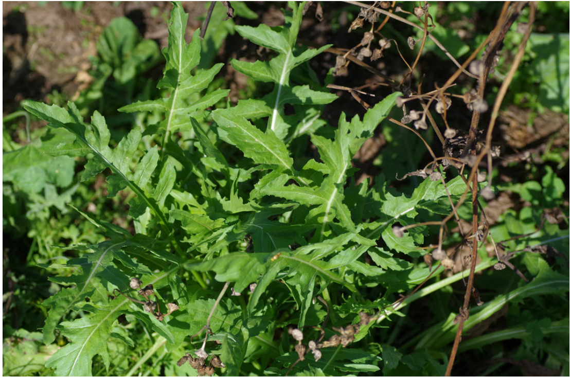
Figure 3.6 London rocket (Sisymbrium irio) on a farm near Gatton, Qld – an example of a weed with a significant local impact.