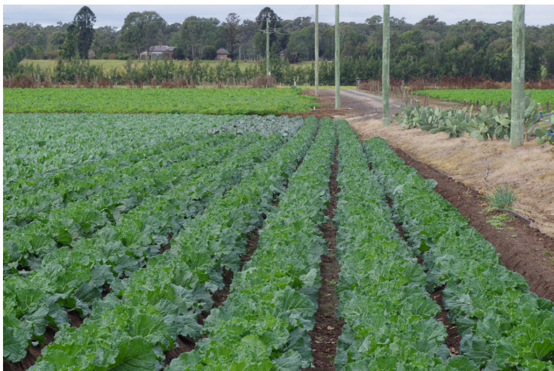
Figure 5.4 A farmer near Richmond, NSW, was experimenting with trickle irrigation to limit the moisture available for weed growth in between the crop rows.