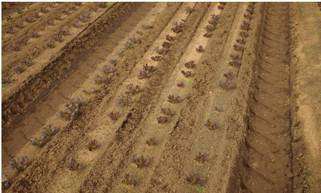
Figure 4.8 Tillage used within a lettuce crop bed near Gingin, WA.

In the case of many vegetable crops (and many significant weeds), shallow tillage within the crop rows (intra-row tillage) may be the only option apart from expensive hand weeding to manage weeds within the crop beds, due to a lack of selective post-emergence herbicides for broadleaf weeds, or in crops where plastic mulch is not used (Figure 4.8). More recently, equipment such as the Weedfix cultivator (Figure 4.9) has been developed to allow farmers to till within the crop rows. These options, as well as their benefits and costs as identified in the literature, are discussed in more detail in Appendix 1, Section 5.2.1.