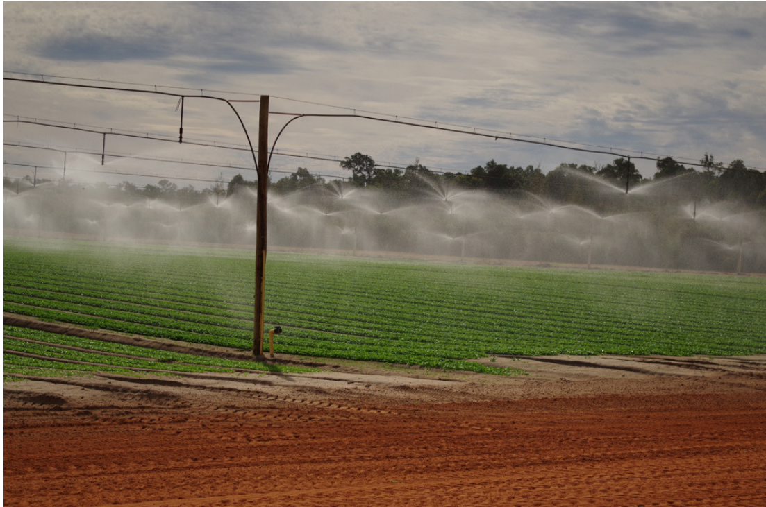
Figure 5.2 Sophisticated overhead irrigation near Gingin, WA.