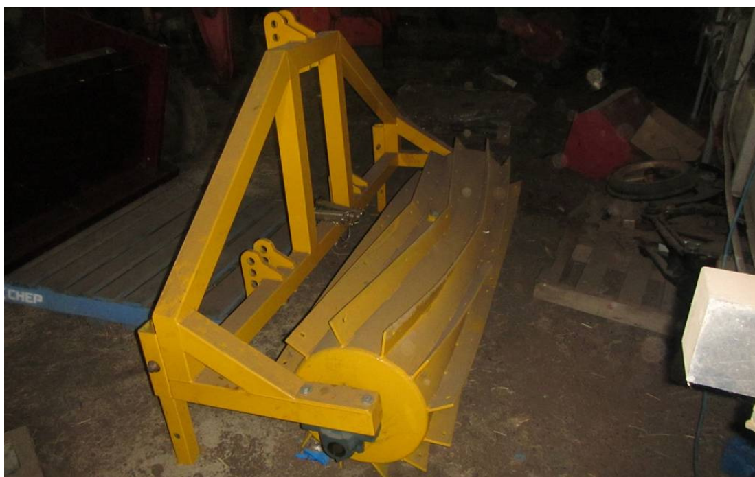
Figure 4.14 Green manure crop 'crimping roller', being trialled on an organic vegetable farm near Gatton, Qld, to provide a cover crop 'killed mulch'.

Several farmers felt that green manure crops were an ineffective weed control method, and indeed counter-productive in allowing weeds to flourish in their paddocks. WA focus group participants pointed out that it can be more difficult to control weeds in some green manure crops, and that they therefore increase the weed seed bank, adding to the future weed burden. A farmer in Qld felt that weed seeding increased in his green manure crops, particularly pigweed ( Portulaca oleracea ).