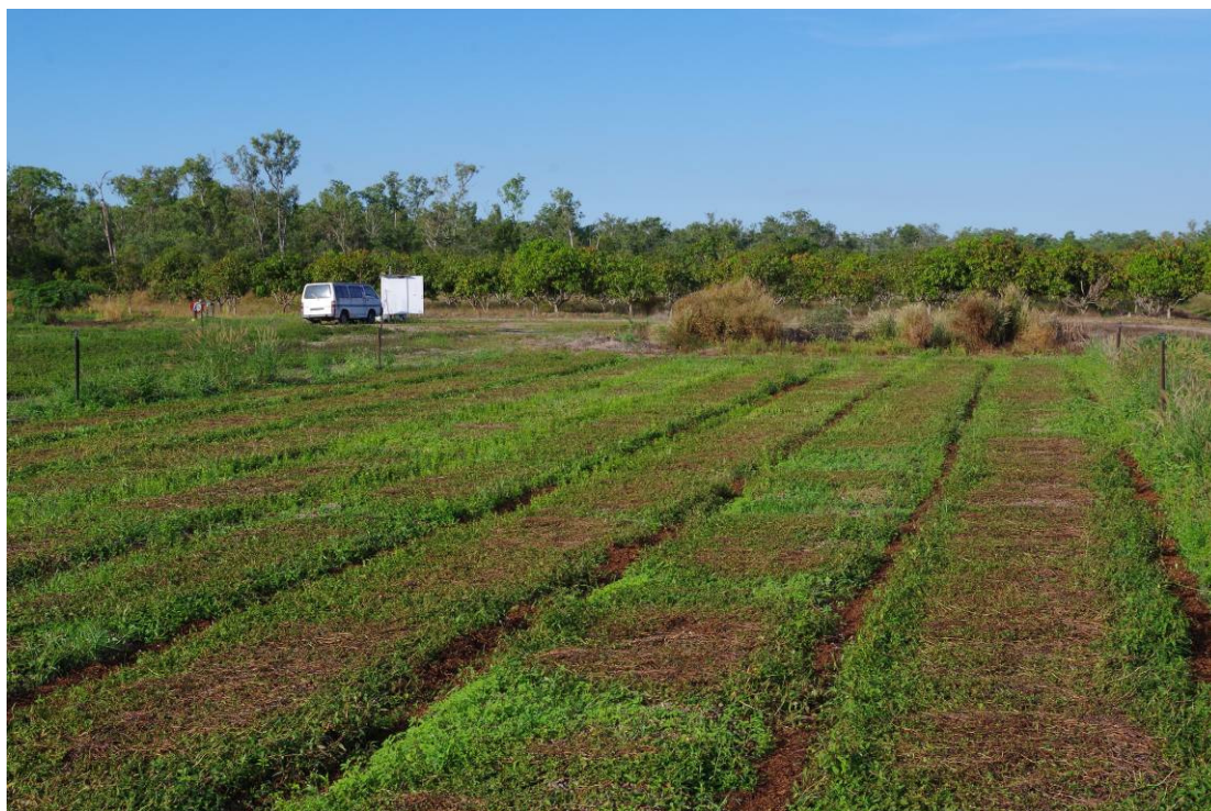
Figure 4.2 Fallow paddocks such as this one near Darwin, NT, can be an important weed refuges if careful fallow management (such as herbicide application) is not undertaken.