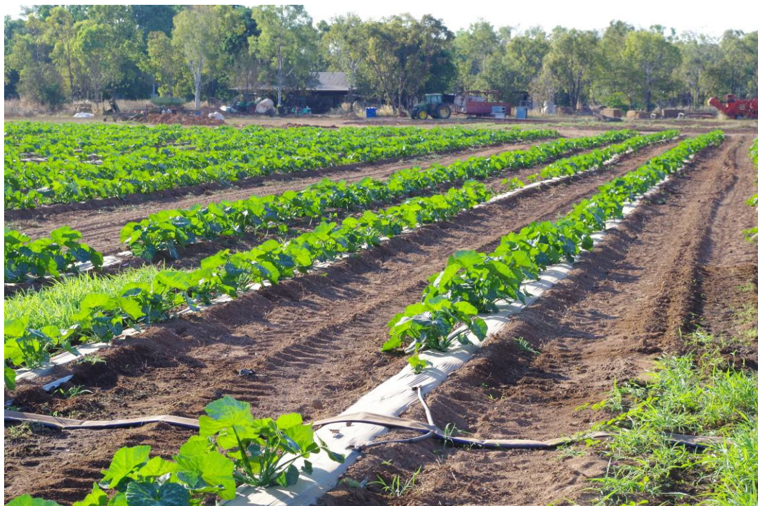
Figure 4.10 Plastic mulch used on a cucurbit crop near Katherine, NT.