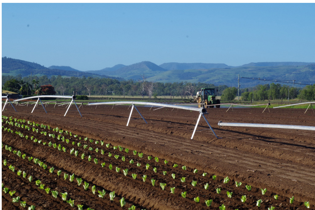
Figure 4.1 Applying pendimethalin (Stomp) pre-plant to lettuce beds near Gatton, Qld. Pendimethalin is an effective and commonly used pre-emergent herbicide, but can stunt lettuce crop growth under certain conditions (Qld DAFF 2010).

A range of pre-emergent herbicides were used by vegetable farmers consulted for this project, including pendimethalin, propyzamide, s-metolachlor, oxyfluorfen, propachlor, and chlorthal-dimethyl (Figure 4.1). Pre-emergent herbicides are incorporated with a light till (used in combination with pre-plant tillage, according to a farmer from Vic); 'rolled' into the crop beds; or applied to beds that have been formed for transplant, or in which seeds are about to germinate. Depending on the crop, some crop tissue damage was noted, although for other farmers the crop was not adversely impacted by pre-emergent application. Residual periods make it difficult for farmers to use some herbicide options. For example, a farmer in WA had used s-metolachlor in their spinach crop, but found the long residual period made it difficult to manage their following lettuce crop.