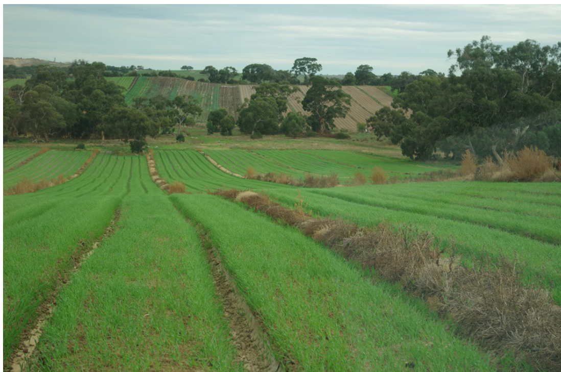
Figure 4.13 Barley used as a green manure crop on a vegetable farm near Currency Creek, SA.

‘Living and killed mulches’ involve using green manure cover crops that have the potential to act as a mulch substitute within a vegetable crop, and may be a substitute to in-crop herbicide application and/or tillage, or plastic mulch film (Rogers 2007). The advantages and disadvantages of green manure crops as a mulch alternative are discussed in detail in Appendix 1, Section 5.7.1. As with organic mulches, green manure crops used as a living or killed mulch may be useful in improving soil health, however their weed management effectiveness appears to be poorer than alternatives such as plastic mulch.