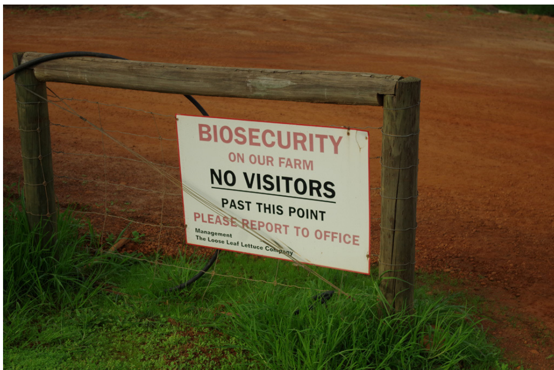
Figure 4.18 Biosecurity sign near Gingin, WA.