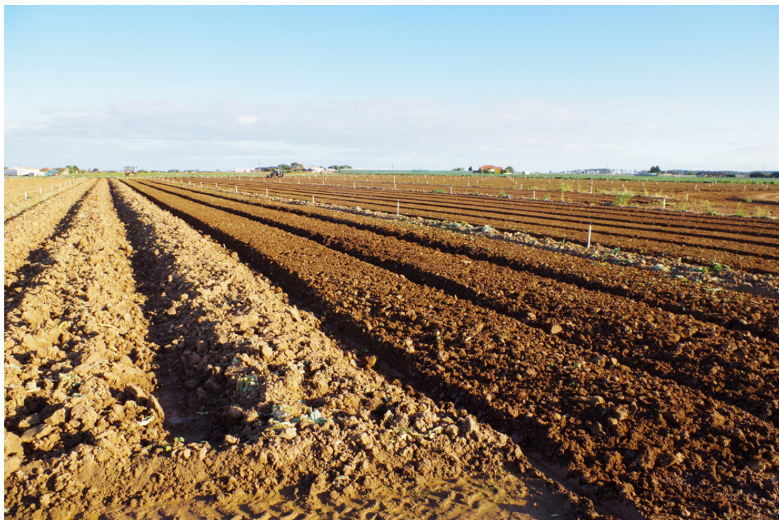
Figure 4.6 An illustration of the stages of crop bed forming near Werribee South, Vic.