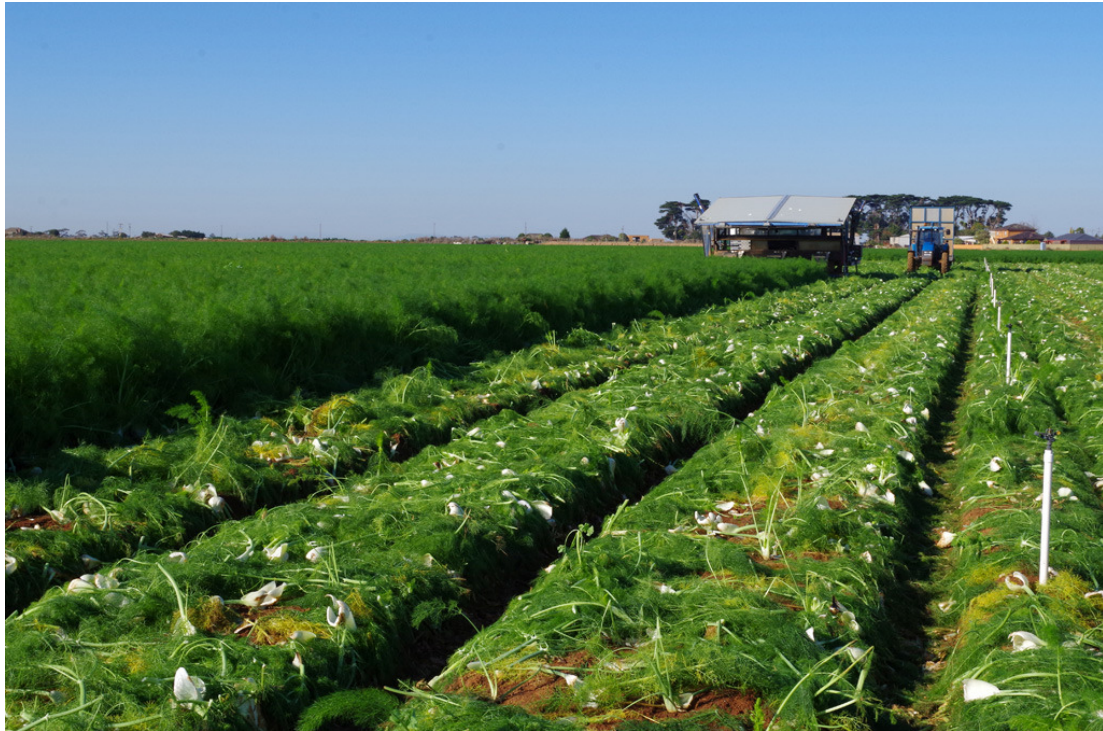
Figure 2.4 Recently harvested fennel crop in Werribee South, Vic.