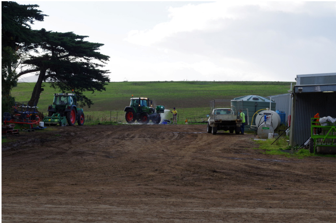
Figure 4.16 Vehicle washdown near Richmond, Tas.