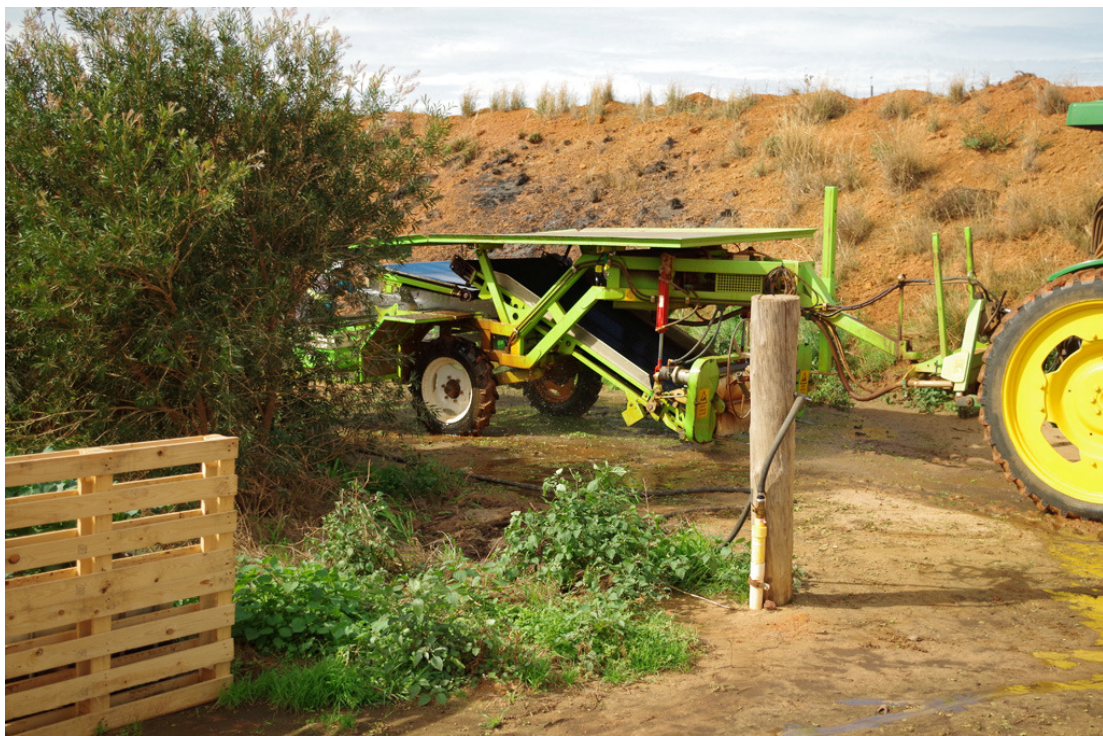
Figure 4.17 Vehicle washdown bay near Gingin WA.