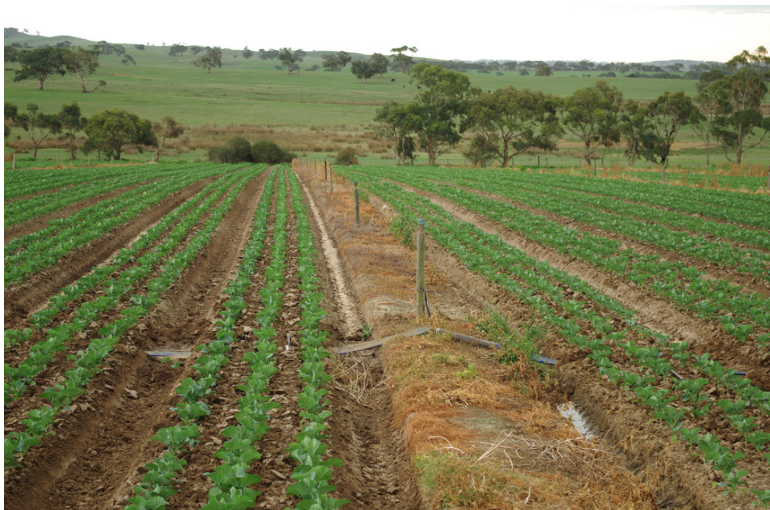
Figure 4.4 Irrigation lines controlled for weeds with shielded non-selective herbicide application, near Adelaide, SA.