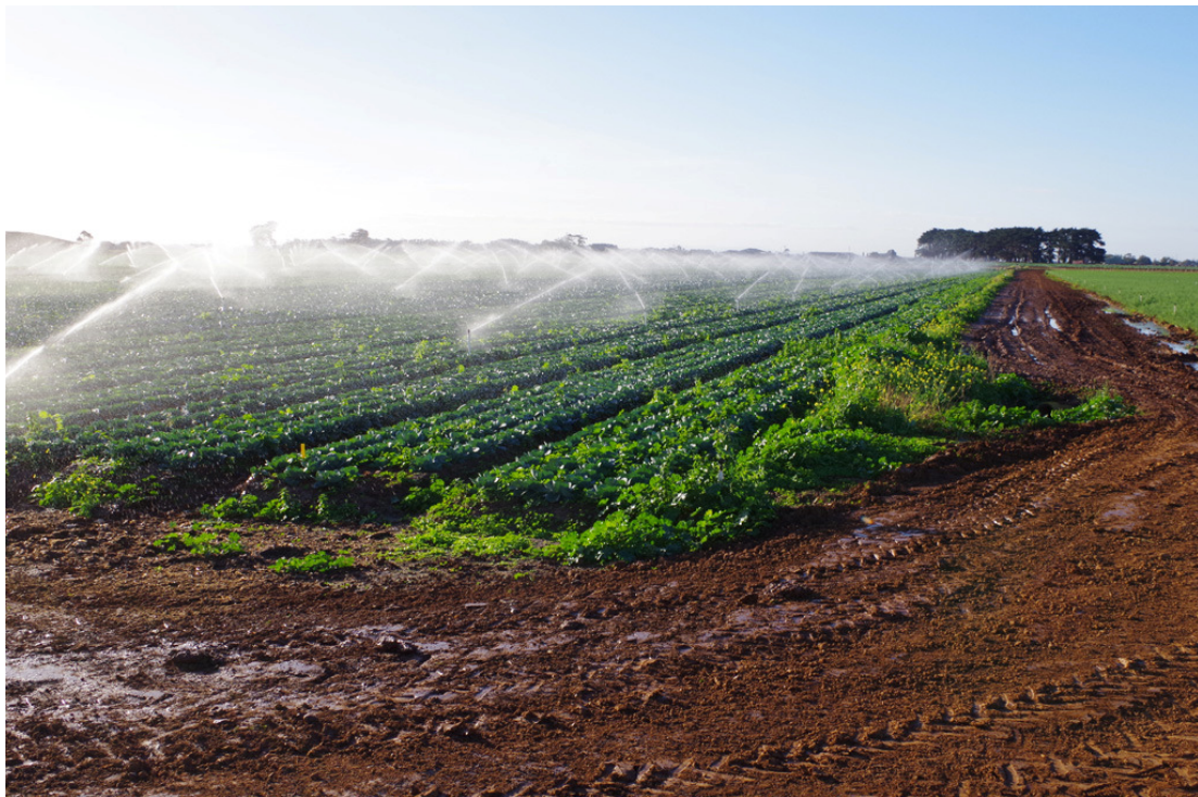
Figure 5.3 Spray irrigation near Werribee, Vic.