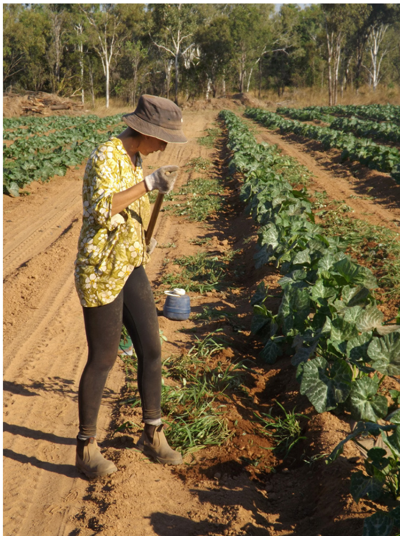
Figure 4.5 Chipping in an organic cucurbit crop in NT.