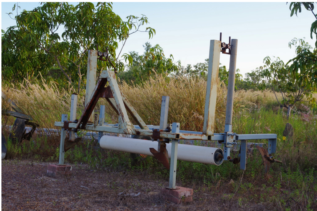
Figure 4.12 Plastic mulch roller for applying mulch film, near Darwin, NT.