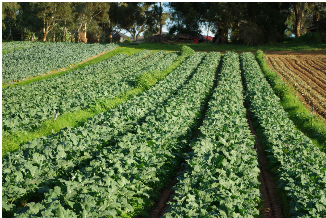
Figure 4.19 Slashing is more commonly used by organic vegetable farmers to manage weeds in areas such as headlands, non-cropping areas and irrigation lines, such as the kikyus growing in the irrigation lines of this organic farm near Adelaide, SA.