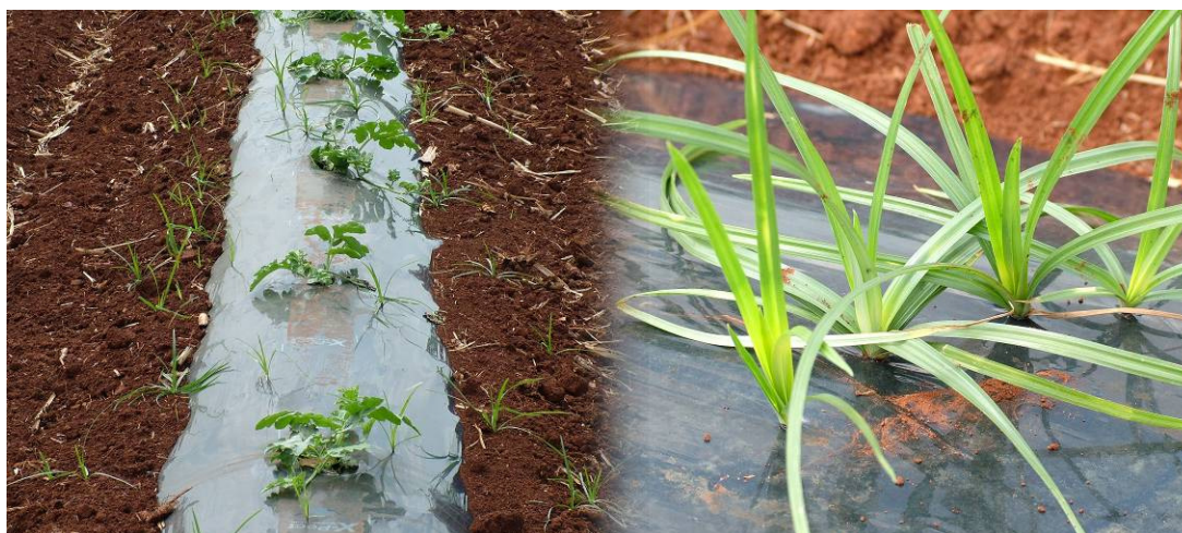
Figure 3.5 Nutgrass piercing plastic mulch in a cucurbit crop near Bundaberg, Qld (Source: Sindel et al. 2011).

Nutgrass is a significant problem in crops where plastic mulch is used. It is capable of piercing the plastic film (Figure 3.5) and attaching clods of soil to the underside, making it more difficult and expensive to dispose of plastic after harvest, as it is heavier to remove from the field, and disposal charges are sometimes by weight (such as in the Richmond district in NSW). Piercing of the plastic was noted in NSW and NT, while NSW farmers also noted that nutgrass has been seen to pierce plastic drip irrigation tape. Nutgrass can also reduce the quality of root vegetables by piercing the crop – a phenomenon noted by project participants in Qld (in carrots), in NSW and NT (in potatoes), and in WA (in onions).