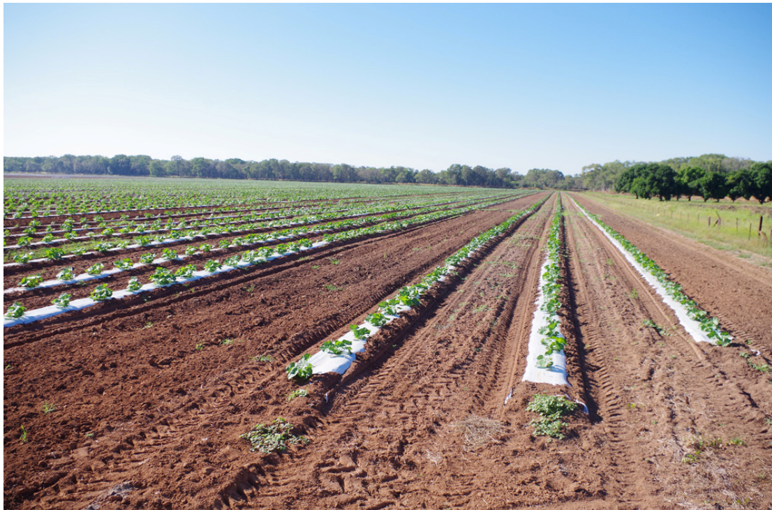
Figure 2.7 Cucurbit farm east of Darwin, NT.