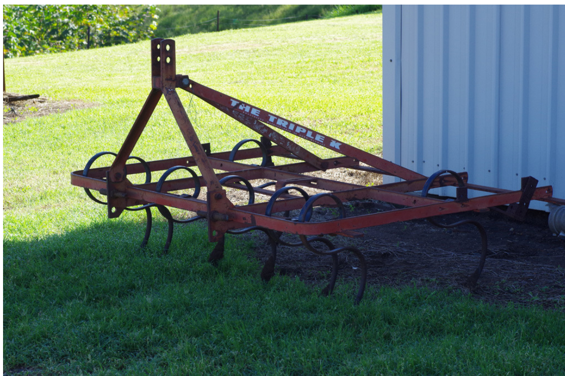
Figure 4.7 Scuffler used for inter-row tillage in Gatton, Qld.

Inter-row tillage involves tilling or cultivation between the crop rows or beds (Figure 4.7), and is carried out at various stages of the crop life, depending on crop being grown (Melander et al. 2005; Qld DAFF 2010; Sindel et al. 2011). Care must be taken, as late attempts at inter-row weed control using tillage may also damage crop roots that have established in the inter-row space (Henderson and Bishop 2000). Nonetheless, inter-row tillage is a successful weed control strategy in most cases, and generally has no negative impact on the crop (Melander et al. 2005). It offers an alternative to inter-row shielded spraying for weed control (Sindel et al. 2011; see also Section 4.1.6).