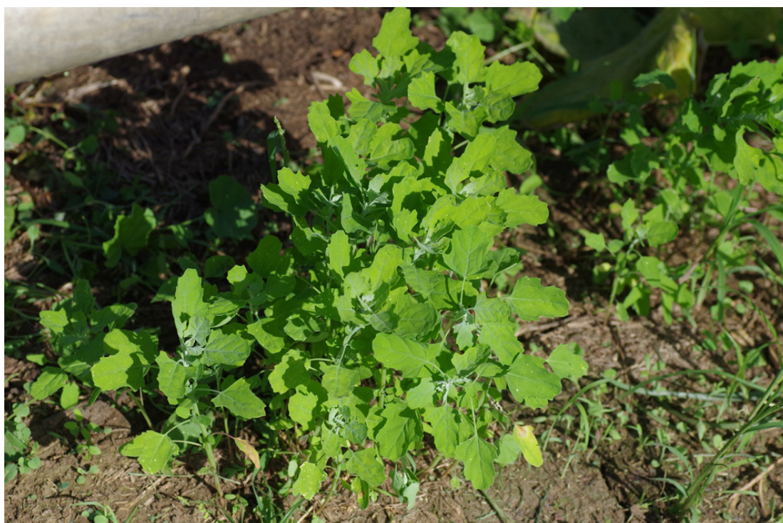
Figure 3.3 Fat hen ( Chenopodium album ) on a farm near Gatton, Qld.

This heavy seeding annual or biennial broadleaf weed is noted for its impact on the yield and quality of a range of vegetable crops in Australia (Figure 3.3). If allowed to grow large enough, fat hen infestations can compete with crop plants for light, nutrients and moisture, and have the capacity to smother crops. Fat hen was noted by a farmer in Qld for its capacity to grow and seed quickly, while another Qld farmer noted that it interfered with harvest machinery (green bean harvesting). Other functionally similar weeds that interfere with harvesting due to their size or density include amaranthus (a noted problem around Tennant Creek, NT), and caltrop ( Tribulus terrestris ). Interference also includes weeds that have prickles which may sting field staff during manual harvesting or weeding, including stinging nettle ( Urtica urens ), caltrop and common thorn apple ( Datura stramonium ).