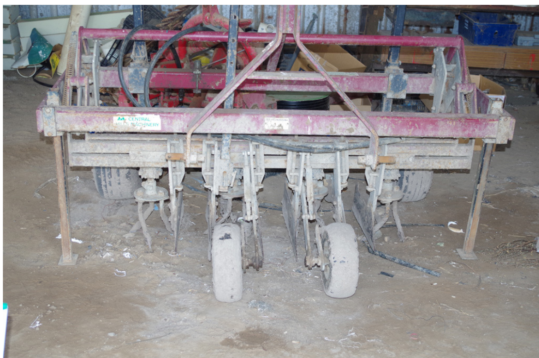
Figure 4.9 Weedfix cultivator used for intra-row tillage near Adelaide, SA.