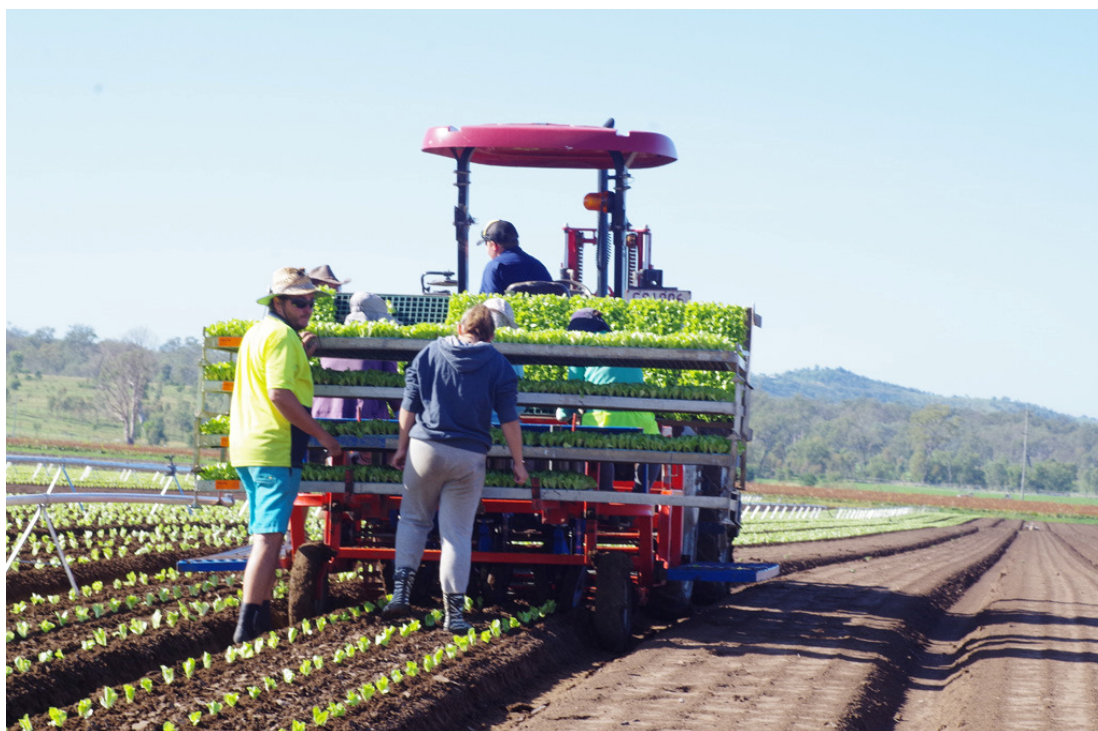
Figure 4.15 Lettuce planting near Gatton, Qld. An ideal planting density will provide some competition with weeds in the crop beds, while at the same time not forcing crop plants to compete with each other for resources.

suppress weed growth in the inter-row space through more effective shading (Borger et al. 2010).