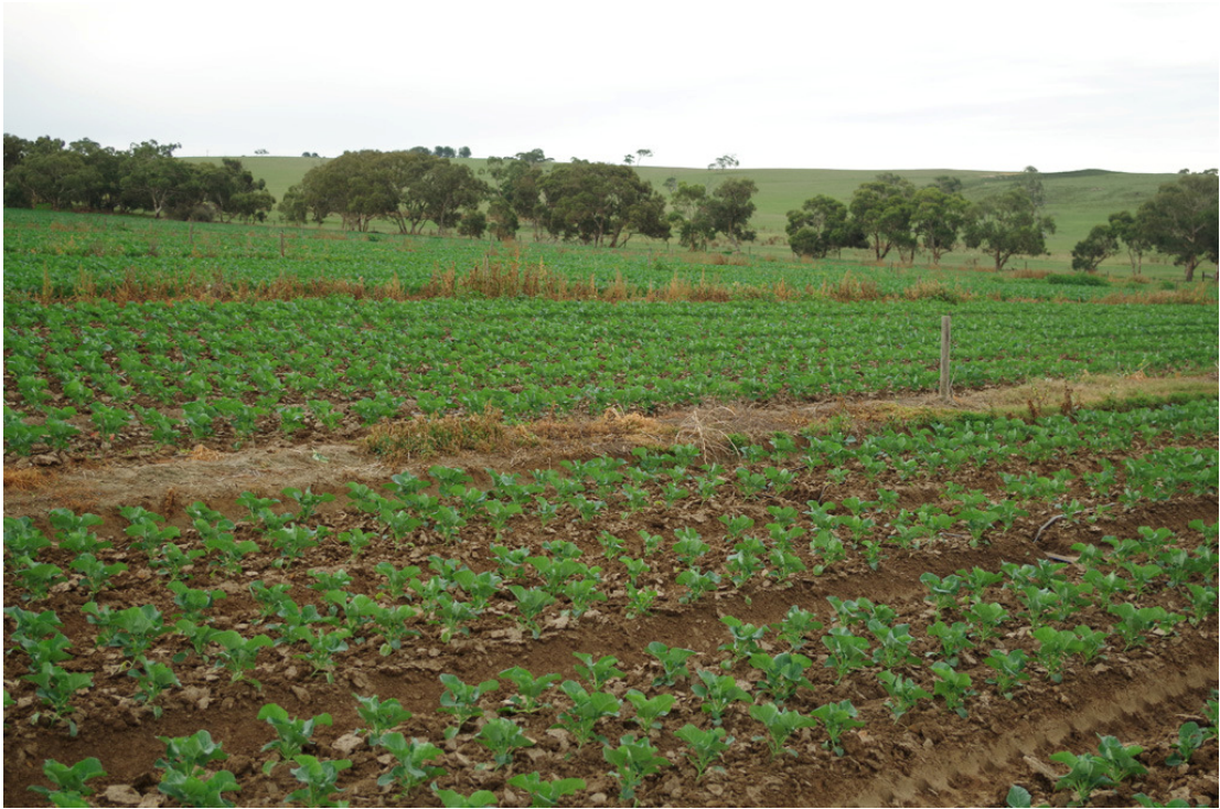
Figure 2.6 Mixed vegetable farm near Currency Creek, SA.