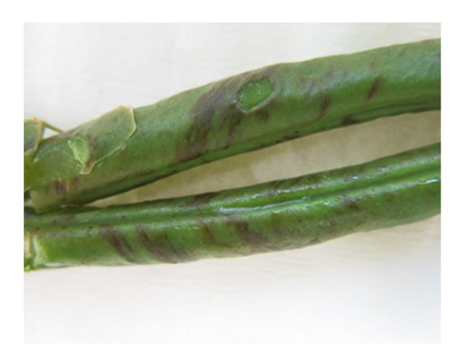
Figure 3 Rust coloured diagonal strips on bean pods attributed to chilling injury

Figure 2 Two examples of symptoms of 'chilling injury' on green bean pods