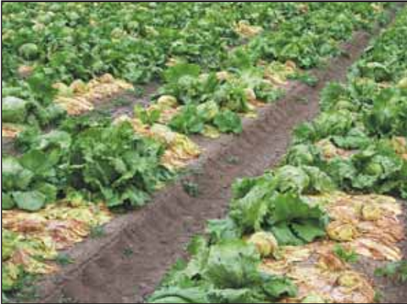
A lettuce crop with Sclerotinia damage.

Pre-harvest assessments are recommended for the purpose of comparing crops and seasons. Counting the number with grub or sclerotinia out of 100 will give a better basis for comparison than simply what is sent to market.