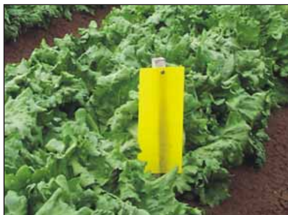
Yellow sticky trap, used particularly in areas prone to Western Flower Thrips.

Other monitoring tools include: Pheromone traps for assessing the proportion of each of the two Heliiothis species and to indicate flights. Be aware, the traps attract male moths but female moths deposit the eggs into the crop. Yellow sticky traps are also useful for accessing thrips species and pressure, particularly important for crops in or near areas with Western Flower Thrips.