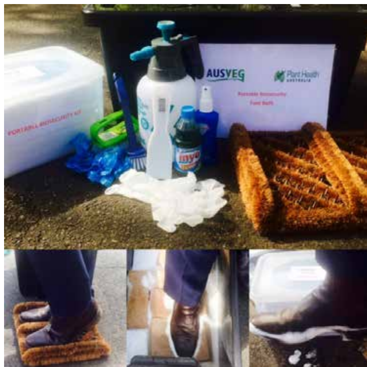
Portable biosecurity kit and footbath

** When disinfecting equipment or machinery surfaces please allow 10 minutes of contact to ensure that surfaces are disinfected properly. For footbaths, be sure that chemicals cover the entire tread of the shoe for 5-10 seconds.