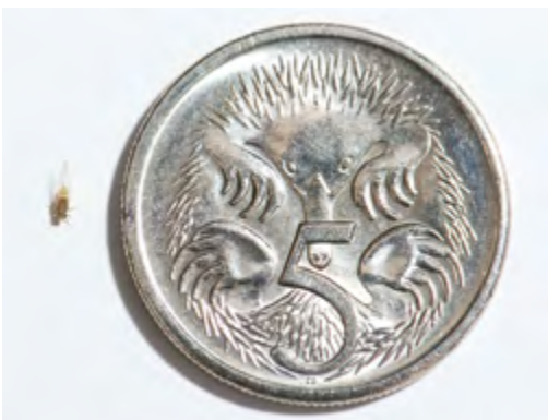
ABOVE: Mature adult TPP in comparison to a 5 cent coin.