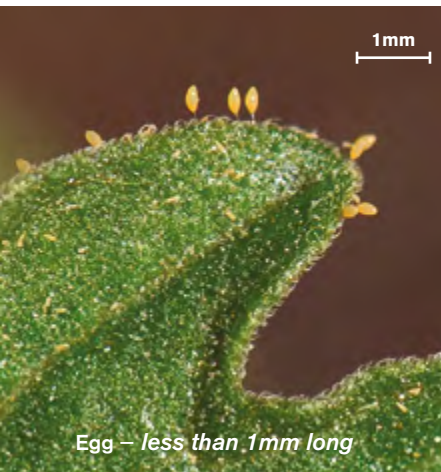
Egg – less than 1mm long