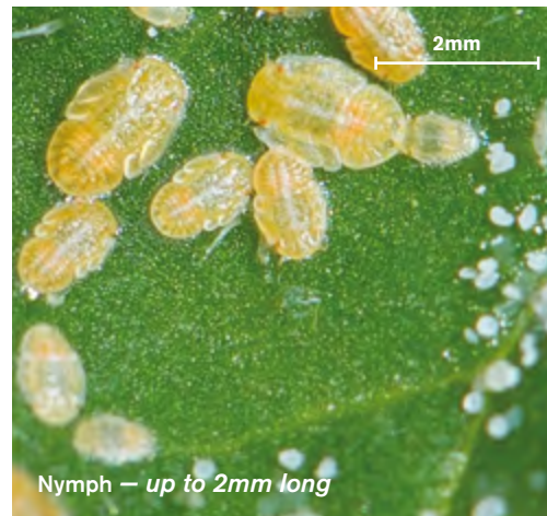
Nymph – up to 2mm long