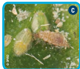
Figure 1. Most efficient predators of TPP in tomato, capsicum and potato, in laboratory trials: (A) H. conformis feeding on TPP eggs and foraging on capsicum leaf. (B) C. montrouzieri feeding on TPP nymph. (C) M. signata larva.