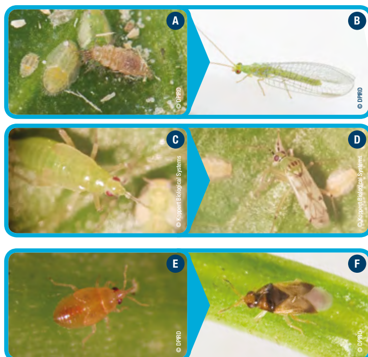
Figure 1. Green lacewing, M. signata (A) larva and (B) adult. (C) N. tenuis nymph and (D) N. tenuis adult. (E) O. tantillus nymph and (F) O. tantillus adult.

Nymphs appeared to be more efficient consumers of TPP than adults.