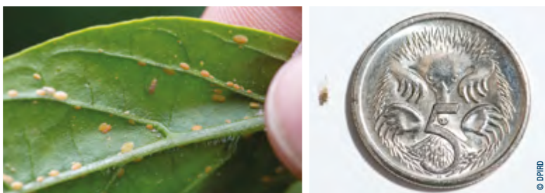
L-R: Tomato potato psyllid adults and nymphs on the back of a leaf. Mature adult TPP in comparison to a 5 cent coin.

Preliminary results of biological control trials are outlined in this factsheet.