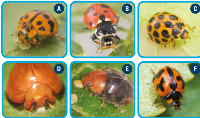
Figure 2. Adult ladybird beetles: (A) H. octomaculata , (B) H. variegata feeding on TPP nymph (C) H. conformis feeding on TPP eggs and foraging on capsicum leaf, (D) C. circumdatus feeding on TPP nymph, (E) C. montrouzieri feeding on TPP nymphs and (F). C. transversalis feeding on TPP nymph.

Tomato potato psyllid Biological control results