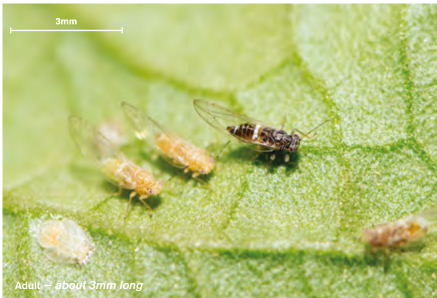
Adult – about 3mm long

TPP is a vector of the bacterium ' Candidatus Liberibacter solanacearum ' (CLso) which can also cause serious crop damage if left unchecked.