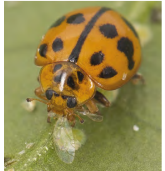
ABOVE: Ladybird feeding on adult TPP.

Key research activities and preliminary trial results are provided in a series of factsheets available in the Appendix of this plan. Note: some insecticides have been made available through emergency permits for use in host crops (Table 1).