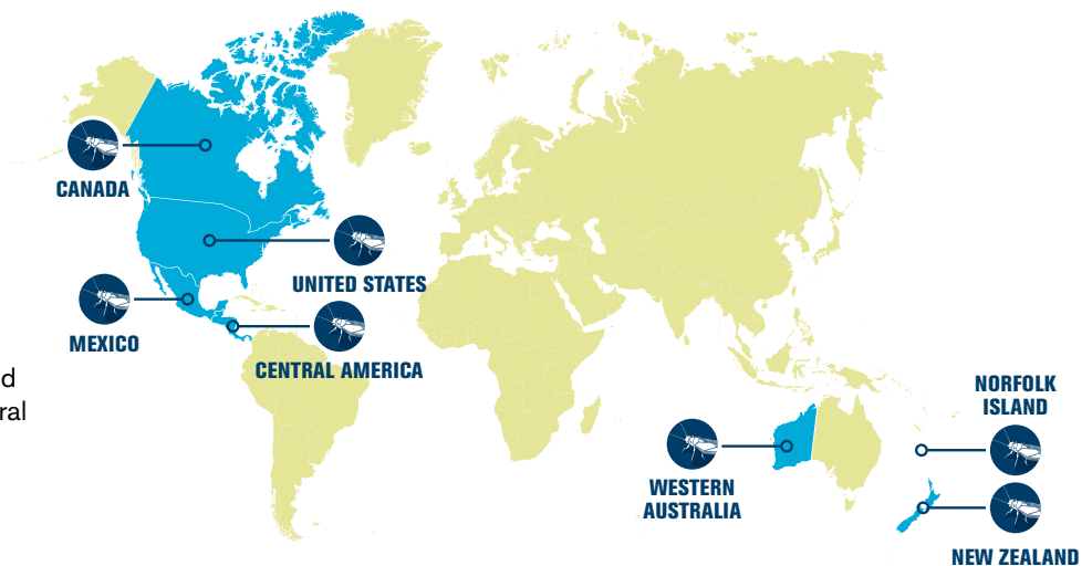
FIGURE 1: Distribution of TPP worldwide

TPP was detected in Western Australia for the first time in February 2017, prompting a comprehensive biosecurity response. It had not previously been found on the Australian mainland and the origin of this detection is unknown. TPP is present on Norfolk Island and other countries including USA, Canada, Central America and New Zealand. It can spread through the movement of host plant material. It can also disperse through natural pathways such as flight, wind and human – assisted movement (movement of plant material).