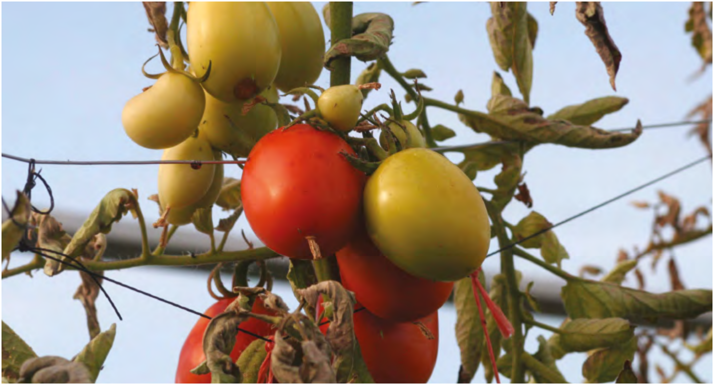
ABOVE: Dull fruit colour from TPP infestation.