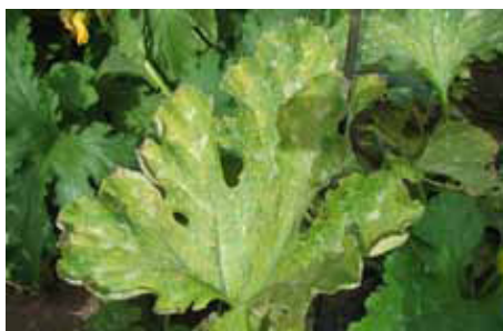
Downy mildew infected zucchini leaf