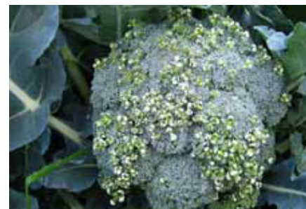
White blister on broccoli