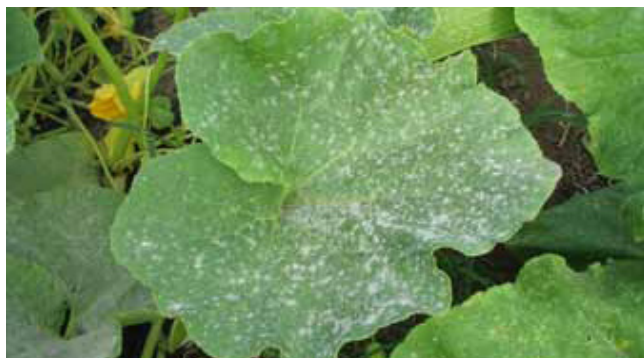
Powdery mildew on pumpkin

Sulphur is the most widely used fungicide for powdery mildew control and despite resistance development being unlikely, sulphur is not suitable for use on all crops, especially during hot weather. Copper may be effective on some downy mildew infections, but on cucurbits the active constituents dimethomorph and metalaxyl are very effective if applied at the onset of the disease.