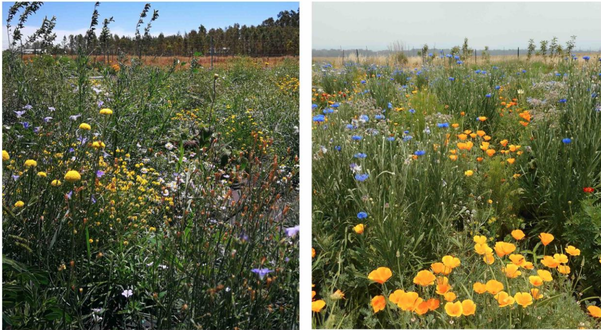
Native (left) and exotic (right) floral strips planted within horticultural areas to provide alternative floral resources for pollinators.

On farm demonstration that non-crop floral diversity around farms can increase pollinator diversity and/or crop flower visitation by pollinators. Our industry partners found that co-flowering floral resources available within and surrounding apple and cherry orchards support pollinators with vital nutrition during and outside the crop flowering period and can enhance pollinator visitation during crop flowering.