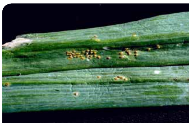
A cultivated garlic leaf with a rust infection caused by Puccinia porri .