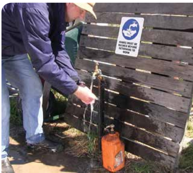
Pests, disease causing organisms and weed seeds can be present on hands, clothing, footwear and personal items.

Foot baths are a simple way to manage biosecurity risks associated with soil-borne pests and weed seeds being carried in dirt and mud. Footbaths need to be maintained well to be effective. See farmbiosecurity.com.au/biosecurity-basics-make-your-own-footbath