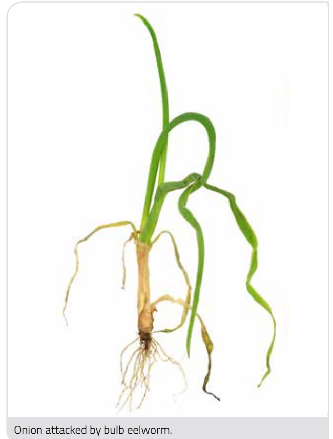
Onion attacked by bulb eelworm.