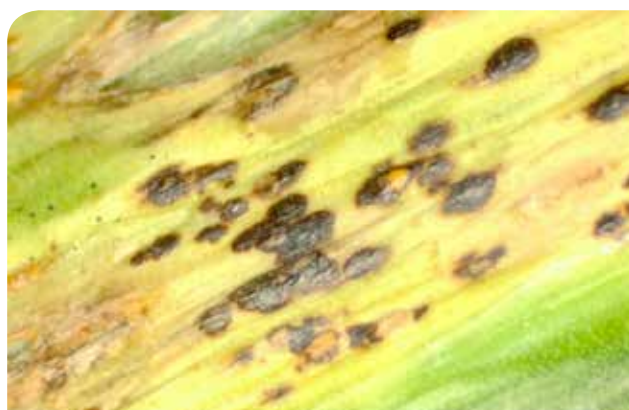
Telia (brown) and uredinia (yellow) on diseased leaf.