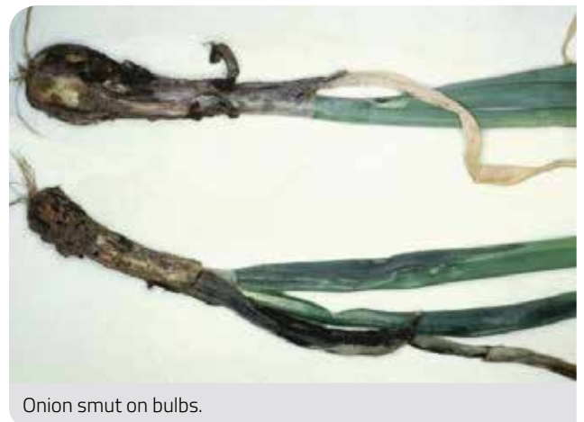
Onion smut on bulbs.