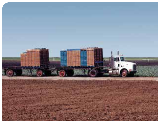
Ensure plant products are fit to travel, your records are up to date and that the transport vehicle is clean.

Onion skins and other waste that is fed to sheep, as is common in some areas, might pose a risk for the spread of diseases such as onion rust, leaf rot and neck rot to crops on nearby properties if not managed well as these diseases are spread by spores that can be blown off a passing truck.