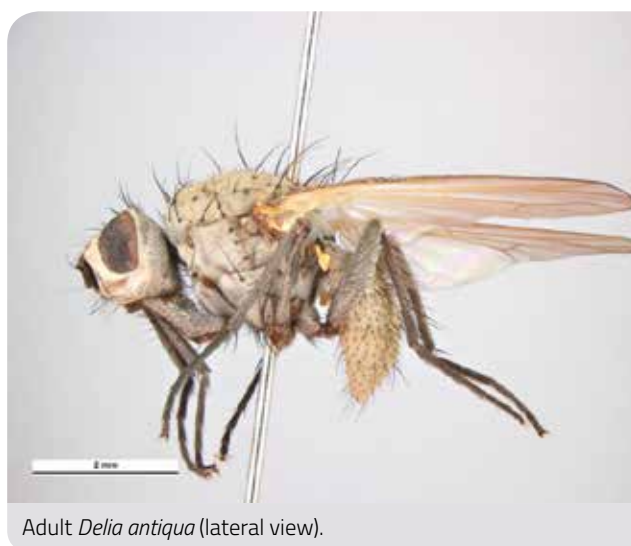
Adult Delia antiqua (lateral view).