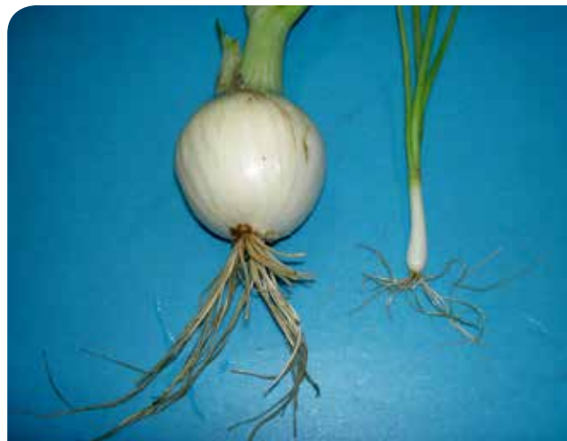
Normal and stunted onions of the same age.