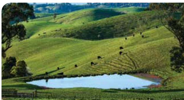
Many pest and disease-causing organisms can survive for a long time in water sources until they find a suitable host.

Protect water sources from contamination as much as possible by making yourself aware of where inflows to your irrigation sources come from. Consider treating water which has flowed off a potentially contaminated onion crop. Consider aerating stagnant bodies of water such as dams to prevent outbreaks of blue-green algae, for example.