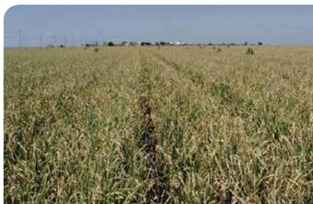
A cultivated garlic crop with a rust infection caused by Puccinia porri .

Several species of rust which can affect onions, garlic and chives are not found in Australia. Any rust symptoms that appear to have greater impact on your onion crop or don't respond as expected to management activities such as fungicide applications should be reported on 1800 084 881.