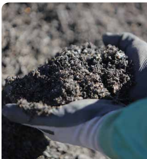
Organic fertilisers such as manure and compost can be a source of weeds if not composted thoroughly.

If you make your own compost, don't include source material that you know comes from diseased plants. It is also important to monitor the temperature and make sure that thresholds for pest destruction are achieved at all points in the pile of composting material.