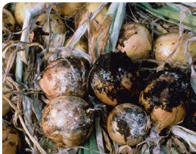
White fluffy bulbs are a key sign of white rot.

Infected plants/material, soil and water.