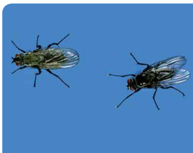
Adult bean flies.