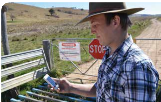
Without signage, visitors and staff may be unaware of the biosecurity procedures enforced on your property.

Non-production vehicles should stay on designated roadways as much as possible when moving around the farm.