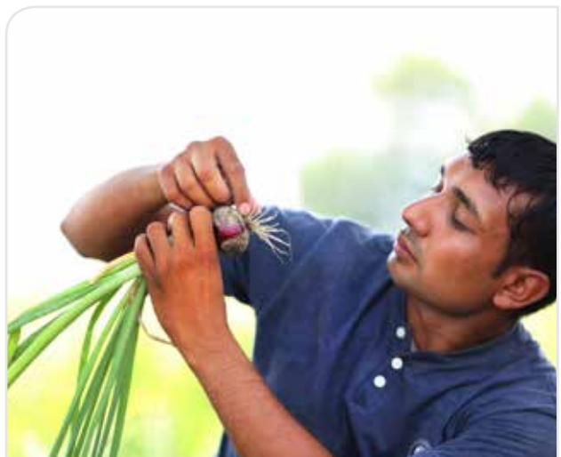
The optimum frequency of monitoring depends on the type of crop being managed, and the production intensity.

Recording that a pest is absent is just as important as recording what you do see.