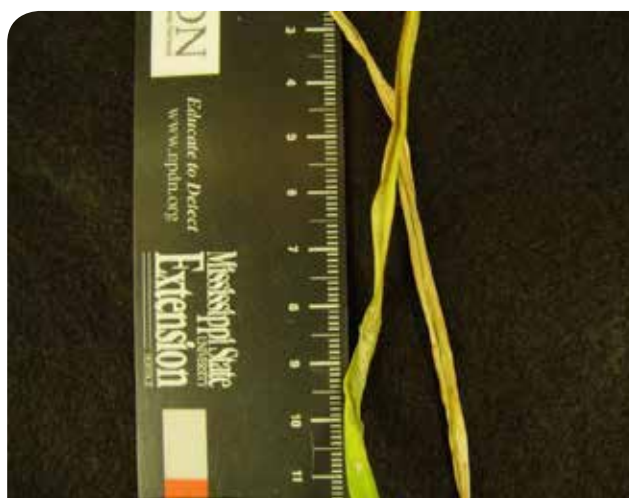
Onion leaf showing signs of leaf blotch.