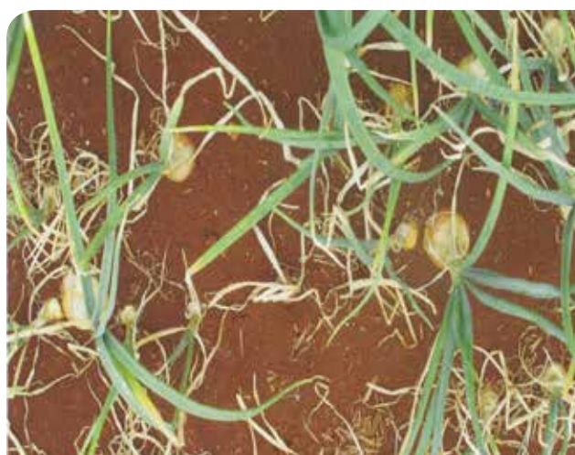
The affect of white rot on onion growth in the field.