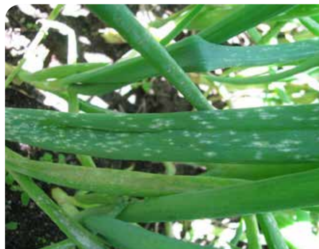
Onion showing symptoms of leaf and neck rot.