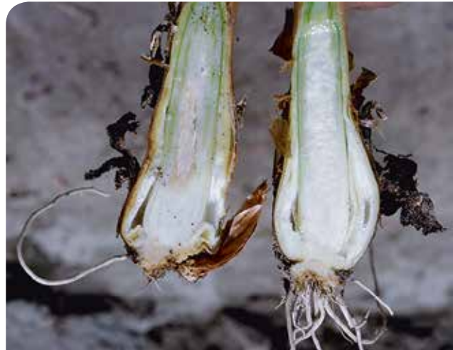
Fusarium basal rot of onion bulbs.

Soil, water, transplanted plants and seedlings.