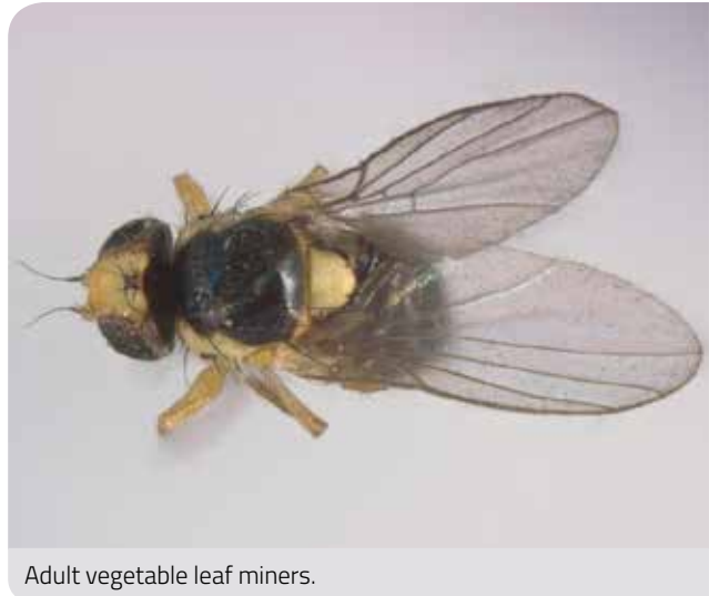
Adult vegetable leaf miners.