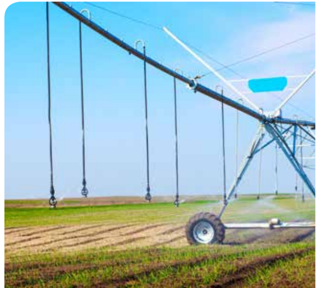
Poor quality water in spray mixes is an input that can spread diseases.

Seed certification schemes need to be recognised by a reputable organisation, especially where seed is imported from overseas. Treatment with a suitable, registered fungicide can also be a useful pre-emptive action to minimise pressures from diseases on the crop growth and yield.