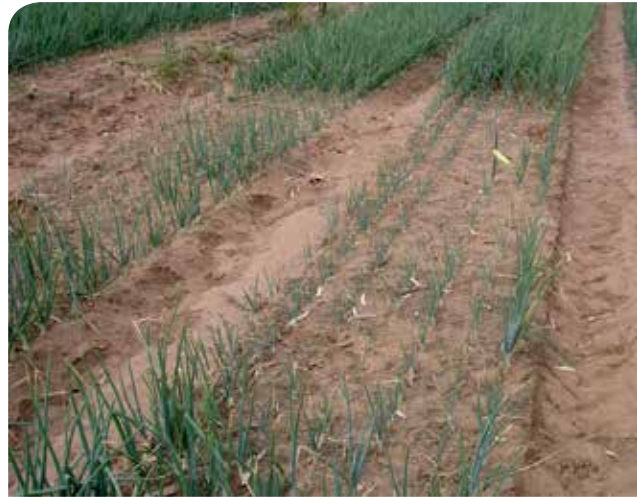
Irregular patches of stunting in the field.

Infected plants/material, soil and water.