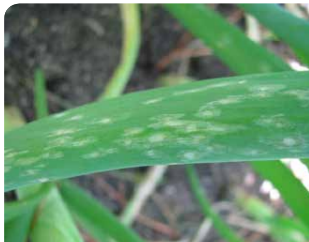
Onion showing symptoms of leaf and neck rot.

Infested soil, plant material, wind, and rain.