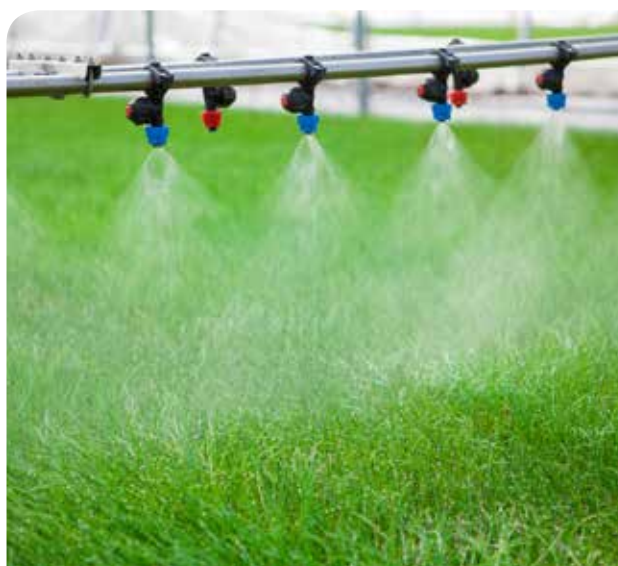
The misuse of chemicals can lead to the development of resistance by pests.

Keep a record of chemical treatments in a spray diary, specifying application rates and weather conditions.