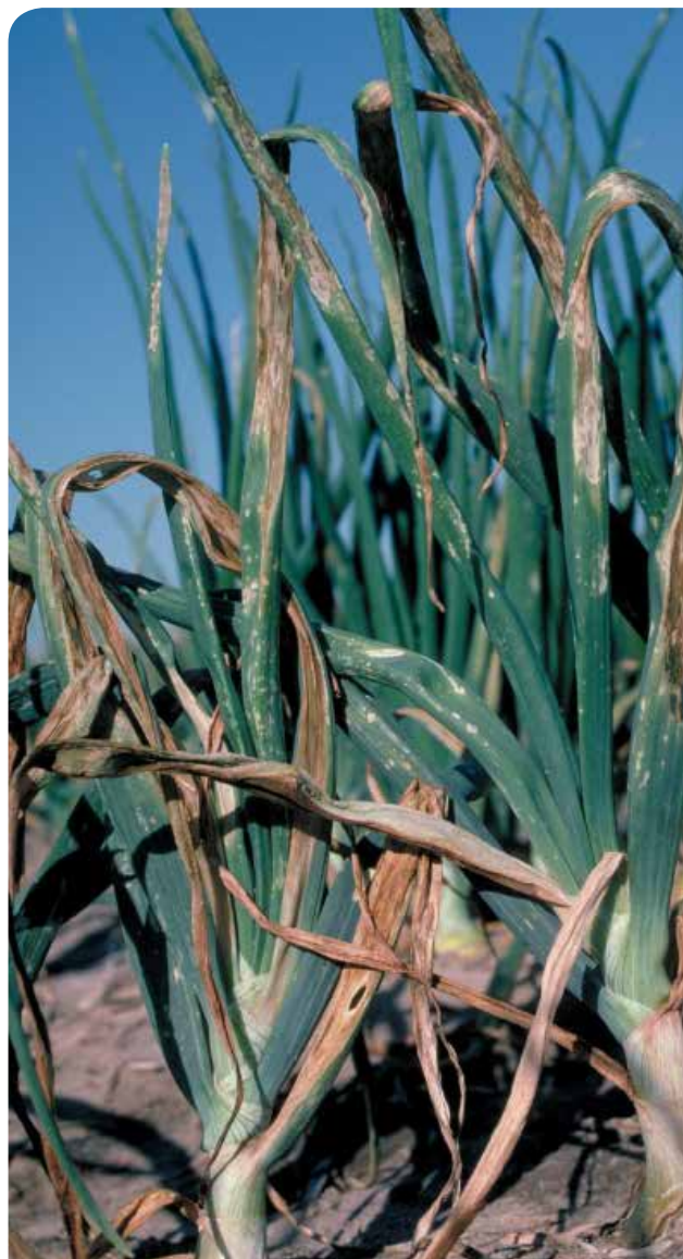
Onion plant showing symptoms of xanthomonas leaf blight.