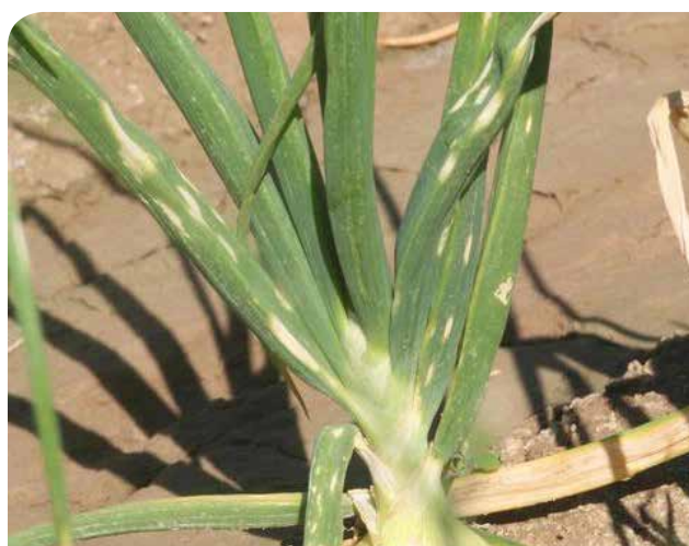
Extensive leaf lesions on heavily affected plant.