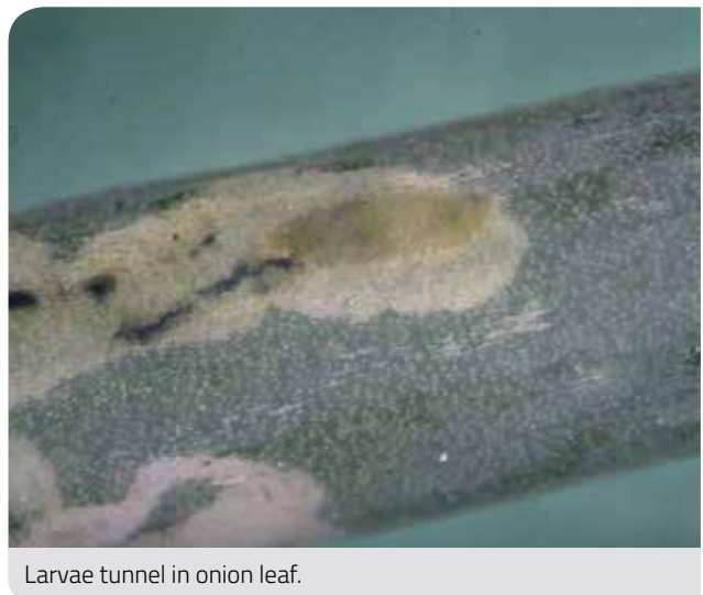
Larvae tunnel in onion leaf.