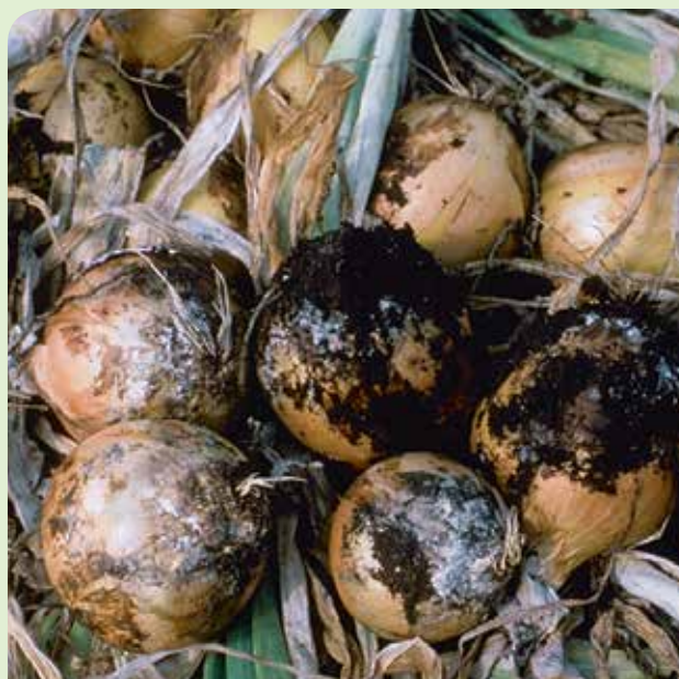
White fluffy bulbs are a key sign of white rot.

A small number of sclerotia can cause significant disease, and it is very difficult to control.