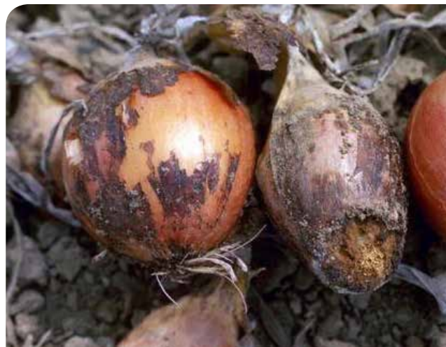
Old onion bulbs showing symptoms of fusarium wilt, fusarium oxysporum f.sp. cepae in the field.