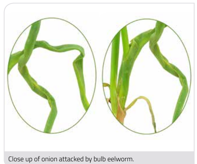
Close up of onion attacked by bulb eelworm.