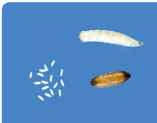
Bean fly at various life stages – eggs on left and larvae on right.