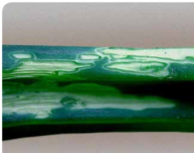
Iris yellow spot virus on onion leaf.