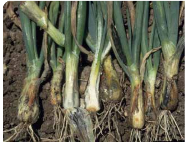
Onion plants with symptoms of the onion smut disease caused by onion smut in the field.

Seedlings, soil, bulbs and as a contaminant on seed.