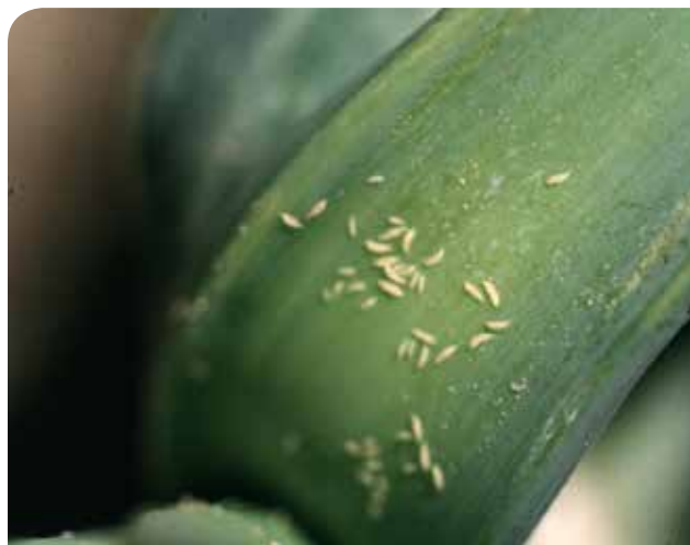
Larvae at base of onion leaf.

Infested plant material. Adults are capable of flight.