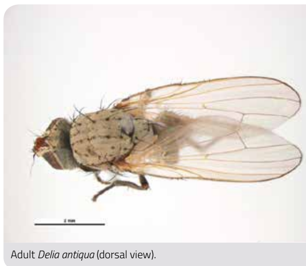
Adult Delia antiqua (dorsal view).