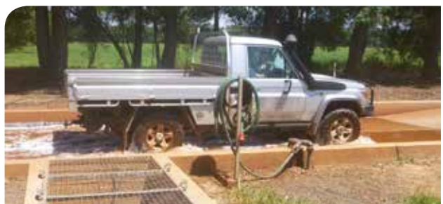
An automatic vehicle wash down bay that provides protection against soil borne diseases.

Use a disinfectant solution that kills the bacterial or fungal pests you're trying to keep off your farm, but that is also safe for regular use on your vehicle and machinery. Speak to your agronomist or ag-reseller to find a suitable product.