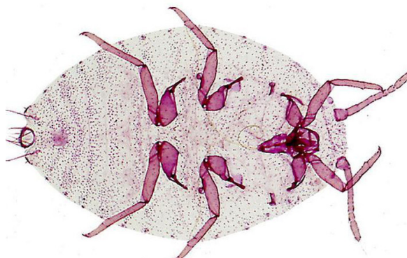
Figure 1. Papaya mealybug ( Paracoccus marginatus ) under a microscope

If crushing is not an option and whole specimens are required, Papaya mealybug may be further distinguished based on its colour when submerged in preservative – Papaya mealybug turns bluish-black within 48 hours of being submerged in ethanol in comparison to Pink hibiscus mealybug, which turns brown.