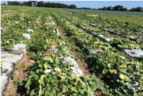
GRKN-infested cucumber crop.