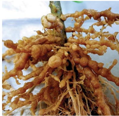
Galling on tomato roots.