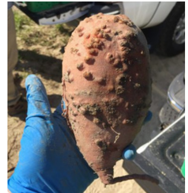
Galling on sweetpotato.

GRKN infects the plant's root system, disrupting uptake of water and nutrients causing yellowing, wilting, and stunting of plants. Early symptoms may appear in small patches when GRKN first establishes, before spreading more widely if susceptible crops continue to be grown in the same site.