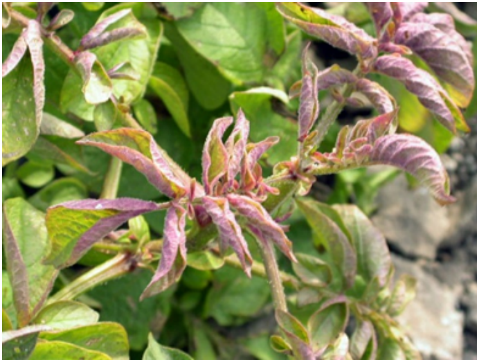
Purple, curled and distorted leaves are common symptoms associated with CLso infection.

Plants infected with CLso may look stunted and unhealthy. Leaves can become yellow, purple, curled or rolled upwards. New growth may appear upright, and plants may produce abnormal shoots or aerial tubers above the ground. Symptoms can vary between crops, and infected plants may not show obvious symptoms in the early stages of infection.