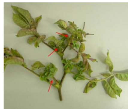
Potato plant showing Zebra Chip symptoms