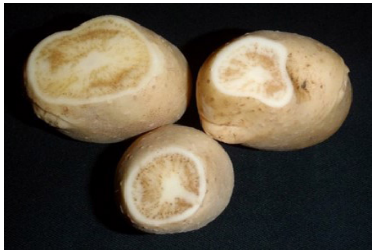
Cut potato tubers showing internal browning, a symptom commonly associated with Zebra Chip disease.

CLso infection can reduce plant growth, yield and crop quality. In potatoes, infection may cause Zebra Chip symptoms, including internal browning of tubers. When infected tubers are processed into chips or fries, dark brown stripes and blotches may develop, giving rise to the name “zebra chip”. Severe infections can lead to substantial quality losses and reduced marketability of produce.