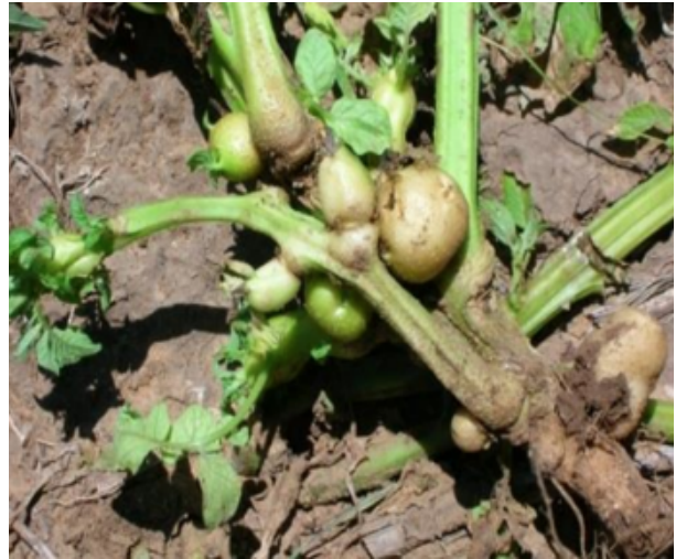
CLso may cause aerial tubers to develop above ground on potato plants.