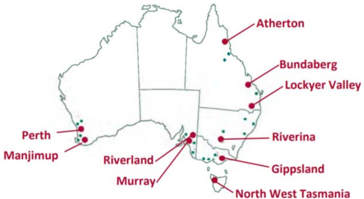
Figure 1: Major potato growing areas of Australia

Australia does not import fresh potatoes. Potatoes grown for processing in Australia account for about 64% of all potatoes grown for consumption, 34% are grown for the domestic fresh market while the remaining 2% is exported for fresh consumption (Horticulture Innovation Australia, 2016). Of the processing crop, the three major states by area are Tasmania (31%), Victoria (26%) and South Australia (21%). The fresh market is dominated by SA (40%), followed by Victoria (19%) and NSW (16%) (Australian Bureau of Statistics, 2016). Approximately 8% of all potatoes are grown for seed (123 000 tonnes) with 40% of these estimated to be certified (Horticulture Innovation Australia, 2016)